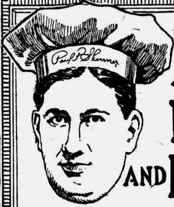
Trade Mark Registered U. S. Patent Office