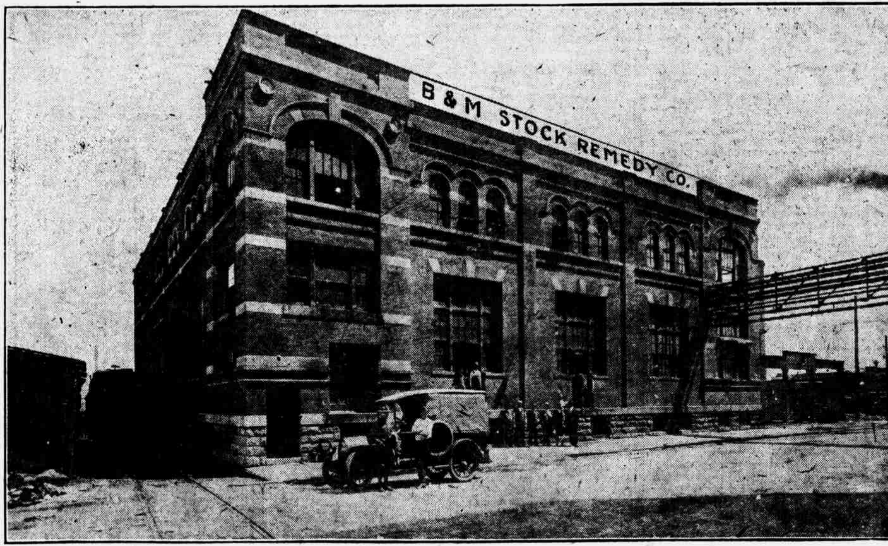
Factory, 7th and Jones Sts. E & M Stock Remedy Co., Omaha.