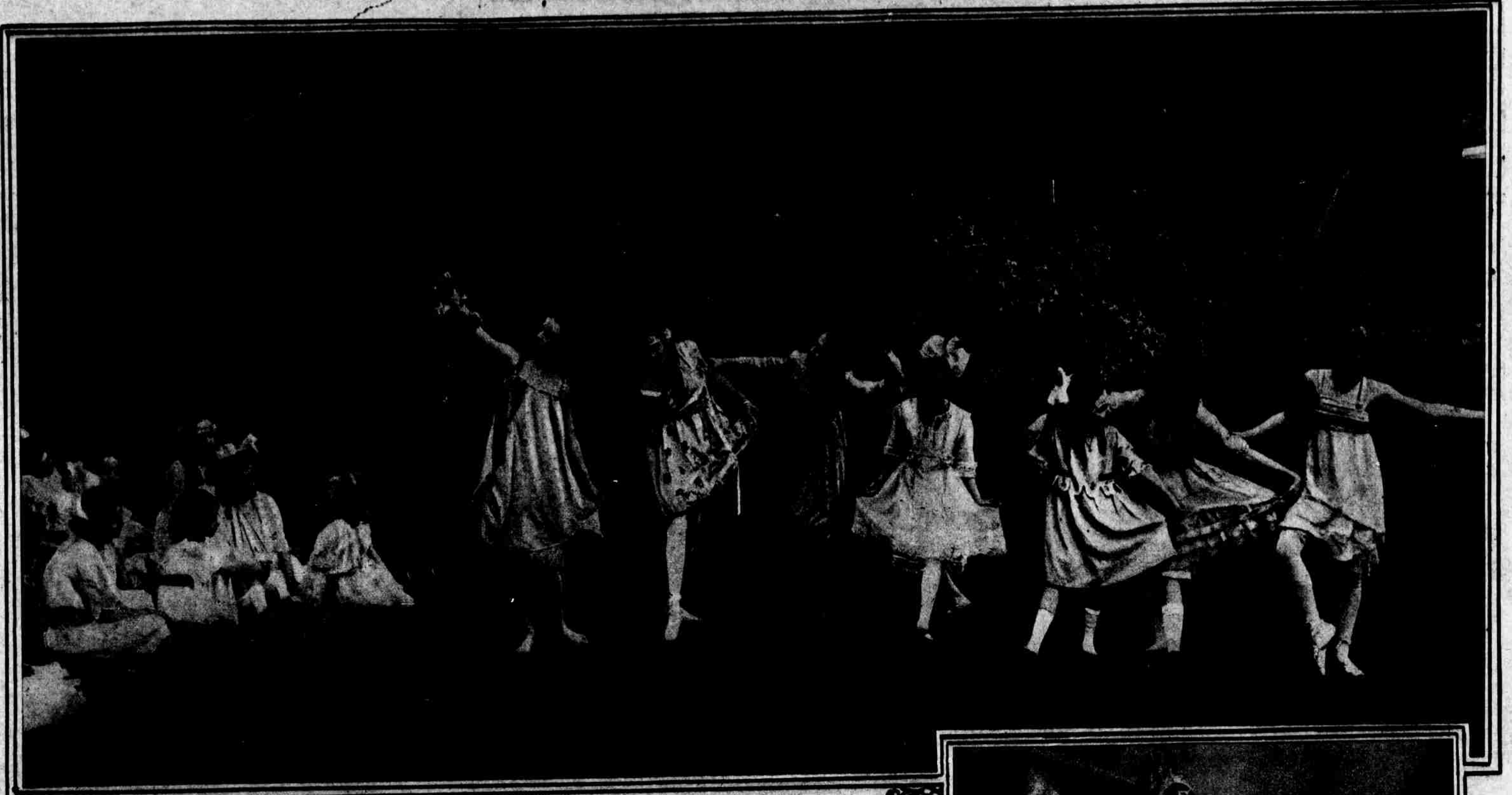
Picturesque Wood Sprites' Dance as performed out on the lawn by a dainty group of young Omaha girls.