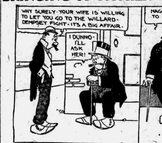
WHY SURELY YOUR WIFE IS WILLING TO LET YOU GO TO THE WILLARD-DEMPEY FIGHT--IT'S A BIG AFFAIR.