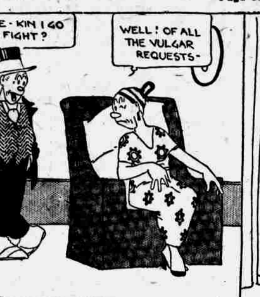
WELL, OF ALL THE VULGAR REQUESTS--