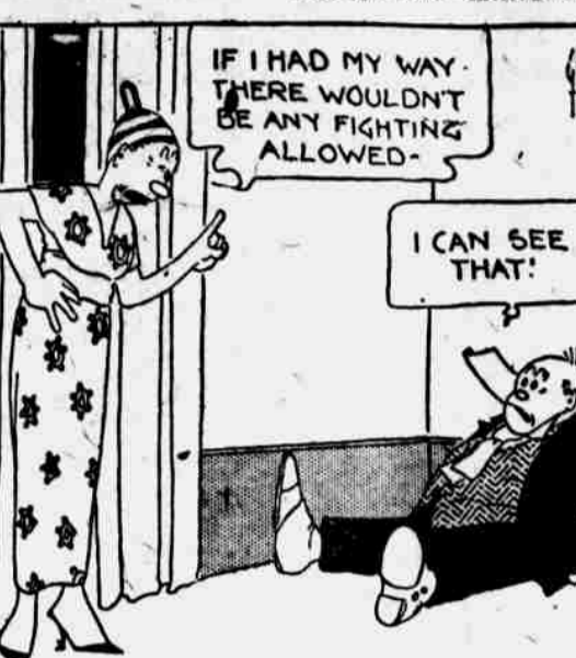
I CAN SEE THAT!