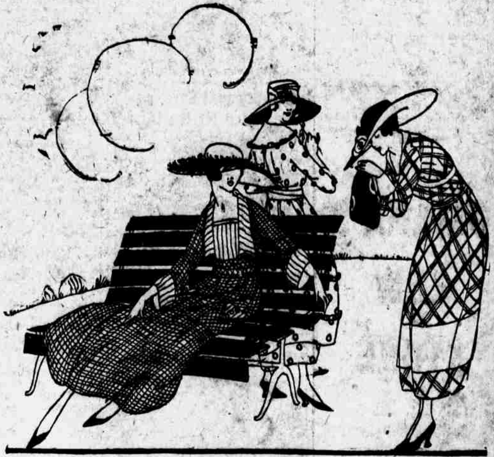
Burgess-Nash Co.—Second Floor.