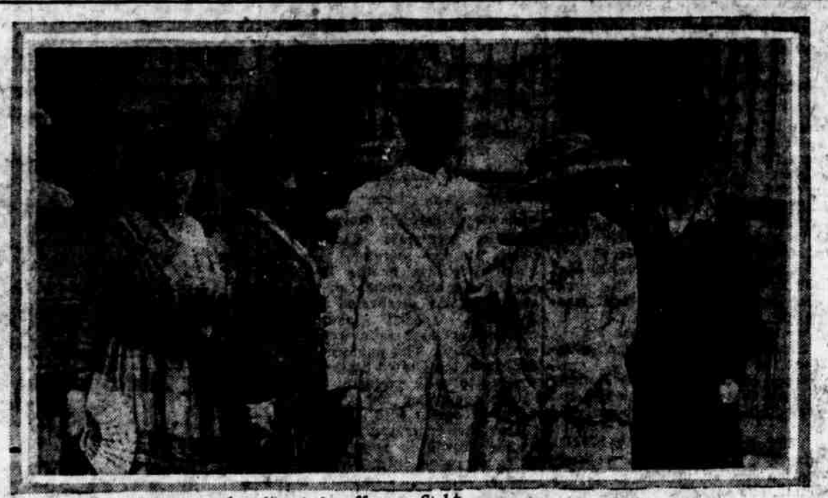
Women who directed suffrage fight.