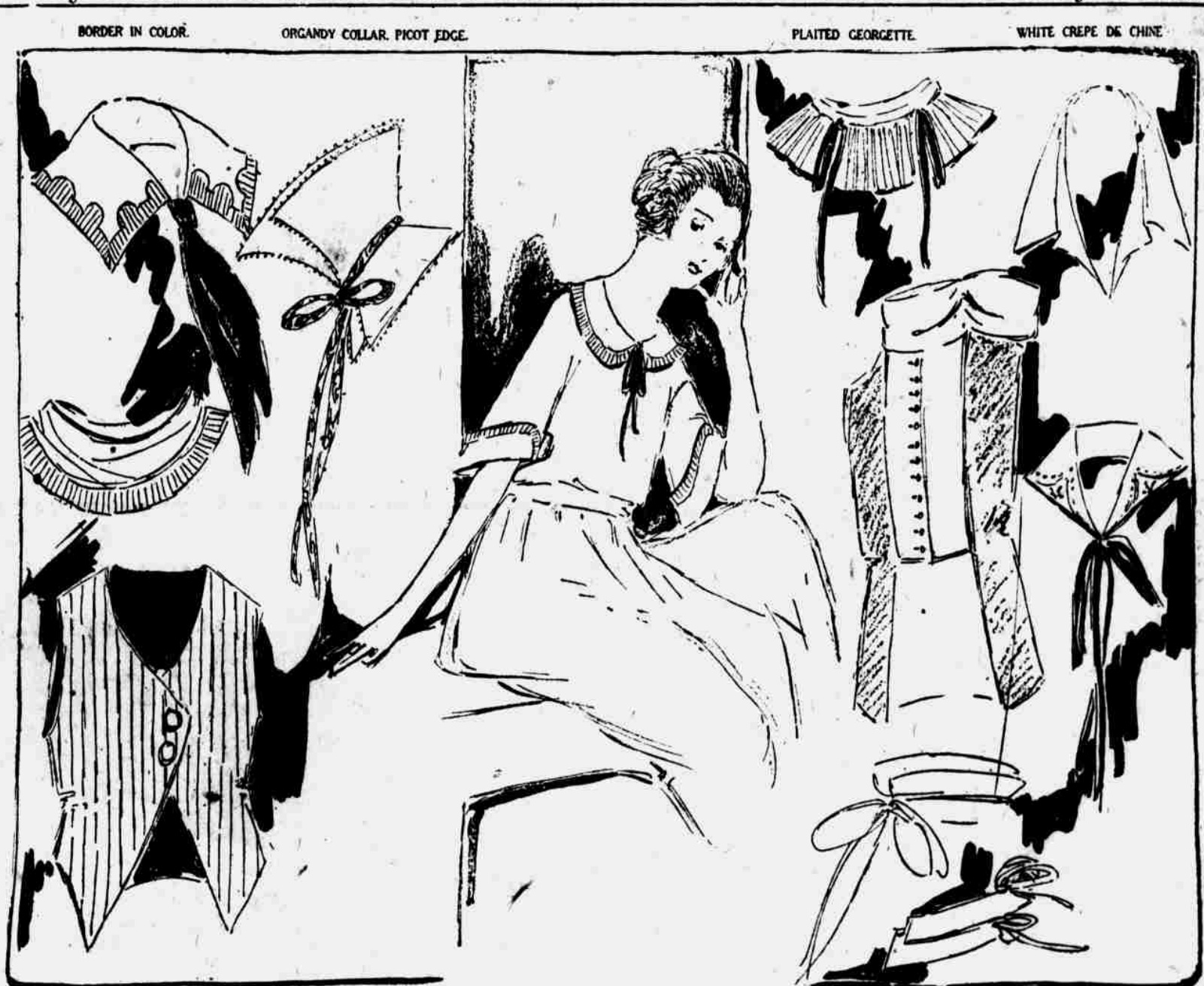
BORDER IN COLOR. ORGANDY COLLAR, PICOT EDGE. PLAITED GEORGETTE. WHITE CREPE DE CHINE. HARBLEIGH STRIPE PIQUE. FRILLED COLLAR AND CUFFS. WHITE SATIN VEST AND STOOL. FANCY COLLARS IN ORGANDY.

IT is to the dainty neckwear that one's attention is especially attracted these days. There are the prettiest of fine organdy collars and cuffs in white or delicate tints, which are the chief charm of a simple little frock of dark voile, English print or other cotton material. Indeed, these sheer dainty collars and cuffs are worn with frocks of materials of any kind and every description.