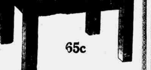
For you not to get one of these foot stools at this price would be a mistake. Come to the store, get one and take it home with you without further delay.