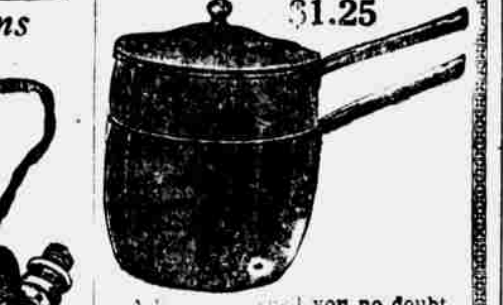
At this price you no doubt could use to good advantage every day when preparing some one meal. At the above price you could well afford to buy two.