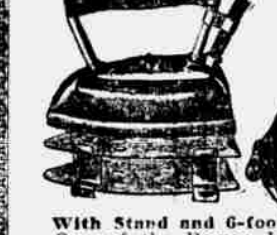
With Stand and 6-foot Cord. One of the Bowen Irons will make your work much easier.

Enamelled Hand Colanders... 24c Enamelled Skimmers... 15c Aluminum Tea Kettles... $2.50 Enamelled Sink Strainers... 21c