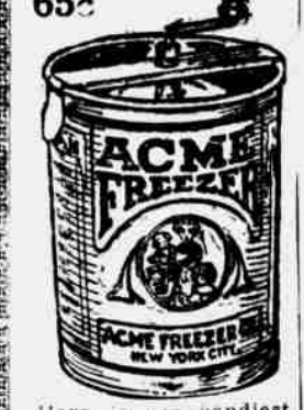
Here is the handiest little freezer you could have. Just think, ice cream in 5 minutes.