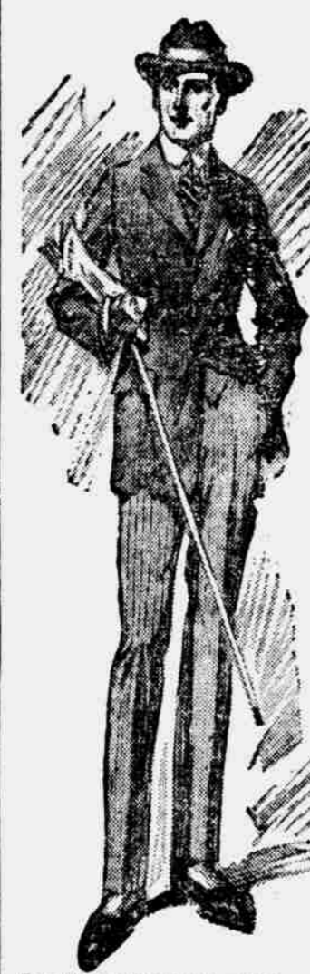
Copyright 1919 Hart Schaffner & Marx

Extra Trousers at $3.95 to $12 All sizes, 30 to 50 waist measure. Variety big enough to insure a really satisfying selection.