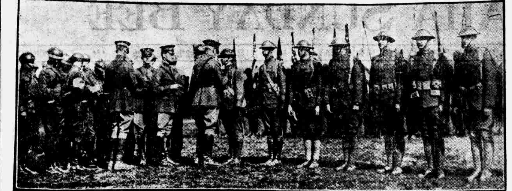
General Pershing Decorating Some of the "Proudest Bucks" of 89th Division, Nebraska Troops, at Trier, Germany, February 20, 1919.