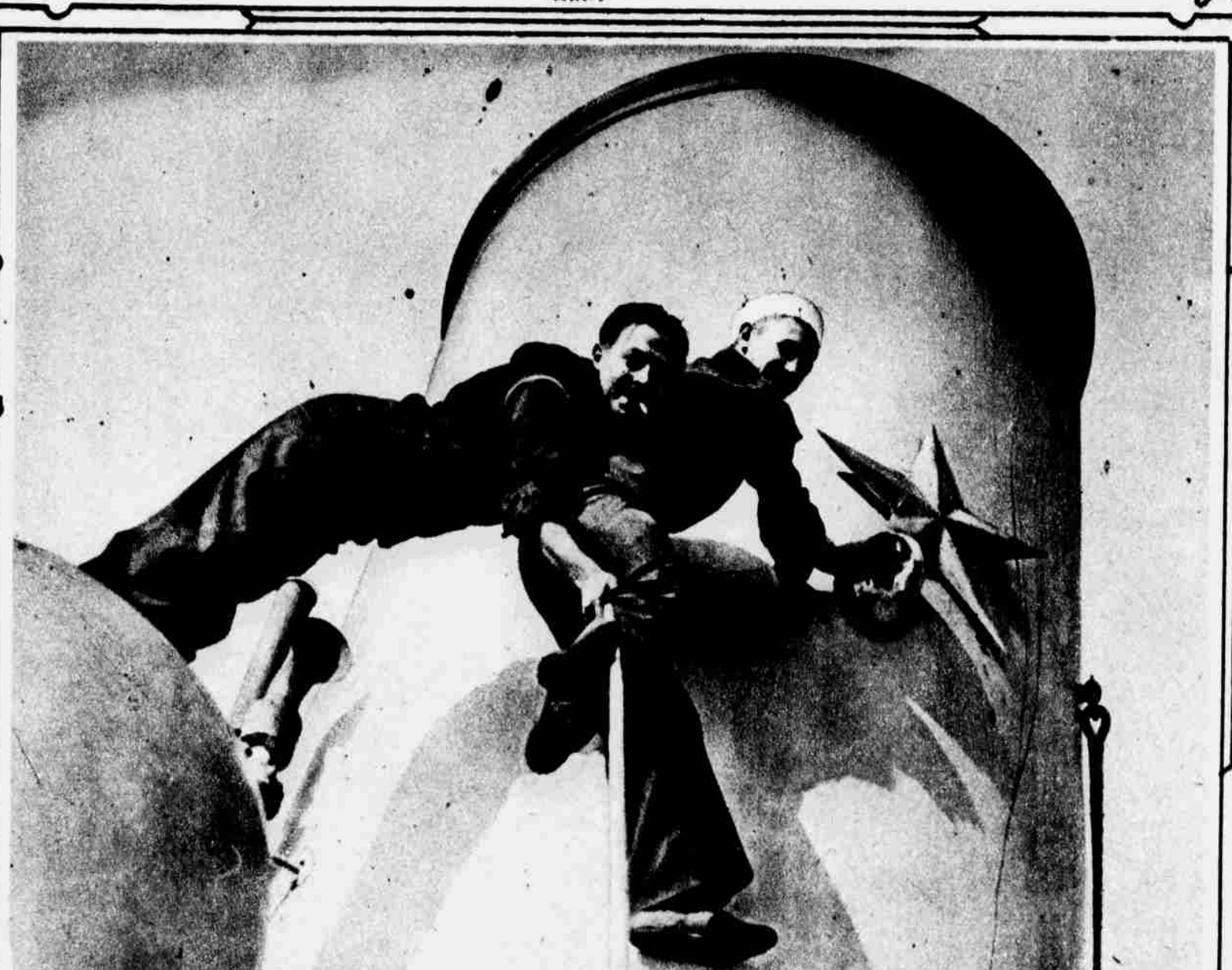
JACKIES POLISHING THE GOLD STAR AWARDED THE VENETIA FOR HAVING CRIPPLED THE U-39. THE SUBMARINE WAS INTERNED IN CARTAGENA, SPAIN.