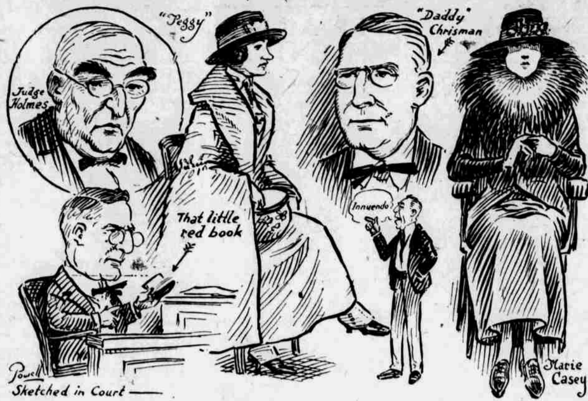
Sketches in Court

from Belle Plaine for funds, did you not? "What is 'Funds'?" "I got $3; you don't call $3 funds, do you?" was the quick reply.