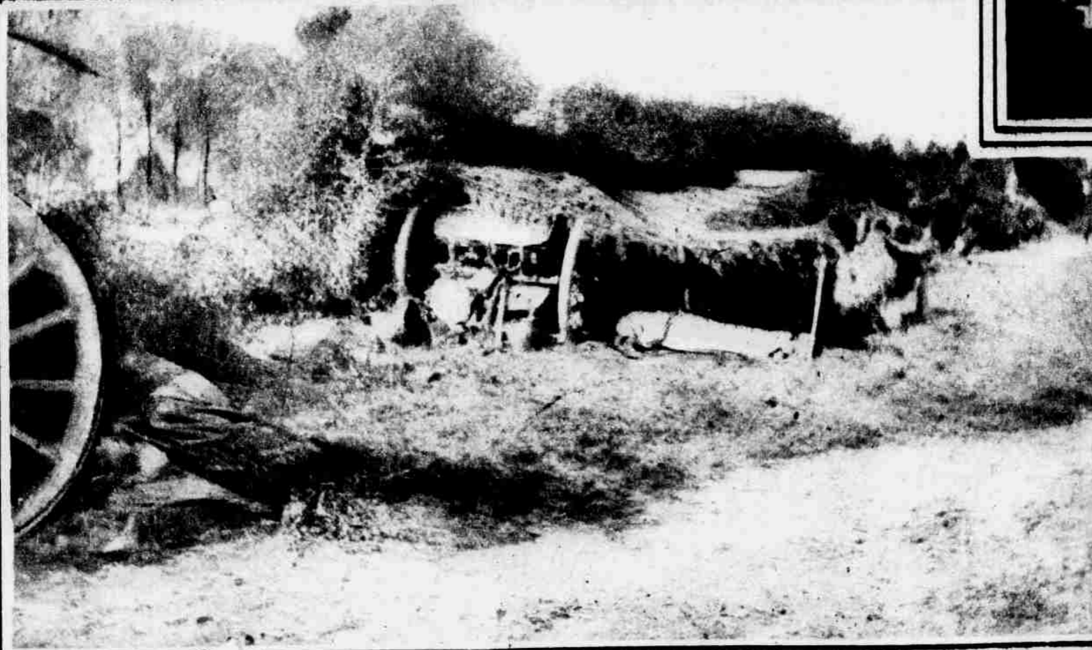
FIRST DIVISION RESTING AT TROYON, ON THE MARCH TO THE ARGONNE. ARTILLERY CAMOUFLAGED TO HIDE IT FROM THE HUN AVIATORS.