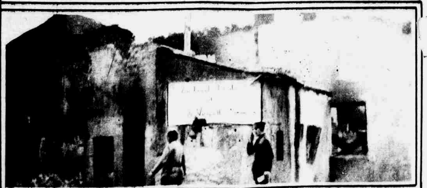
ONE OF THE DEVASTATED TOWNS IN THE ST. MIHIEL SECTOR CAPTURED BY THE AMERICANS, SEPTEMBER, 1918.