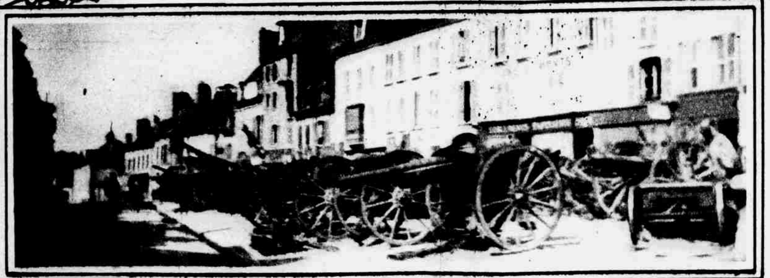
GERMAN FIELD ARTILLERY, MORTARS AND ANTI-AIRCRAFT GUNS CAPTURED BY FIRST AND SECOND AMERICAN DIVISIONS, IN PUBLIC SQUARE AT VILLERS-COTTERETES.