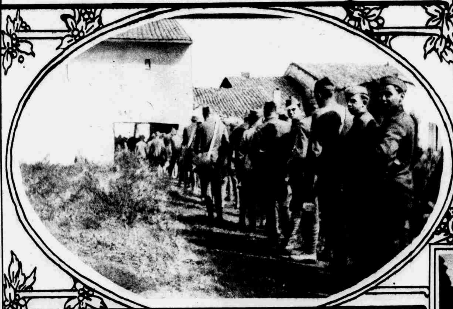
AMERICAN TROOPS ON THE MARCH LINED UP FOR MESS.