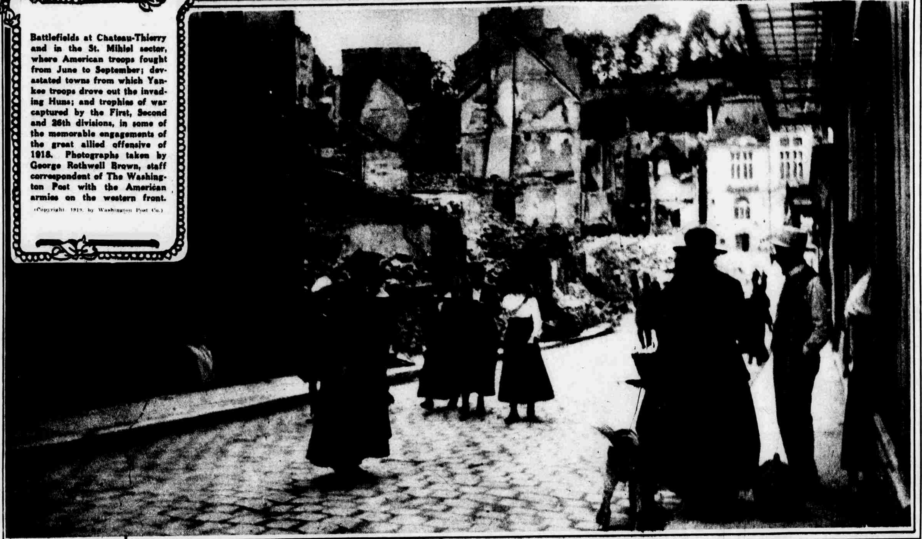
THE HEART OF CHATEAU-THIERRY AS IT IS TODAY.