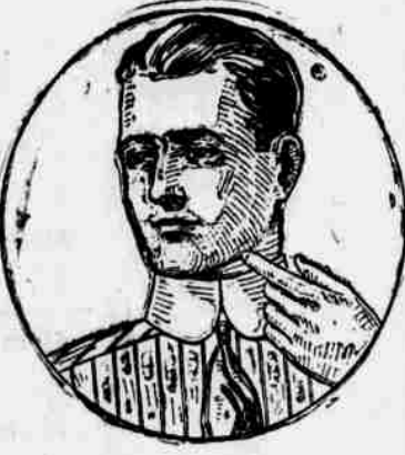
Your Collar Will Set Just Right.