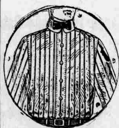
Five-button Center Pleat insures Good Looks.

Try a Beau Brummel Shirt for the finishing touch to that new suit—it will give you real "shirt satisfaction."