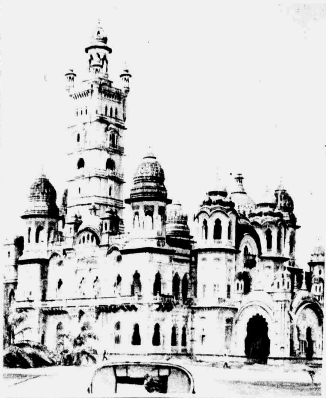
IN THE BRIGHT SUNLIGHT THIS PALACE FAIRLY SPARKLES IN ITS FAR EASTERN GOODNESS. IT IS THE RAJ MAHAL, BARODA, INDIA.