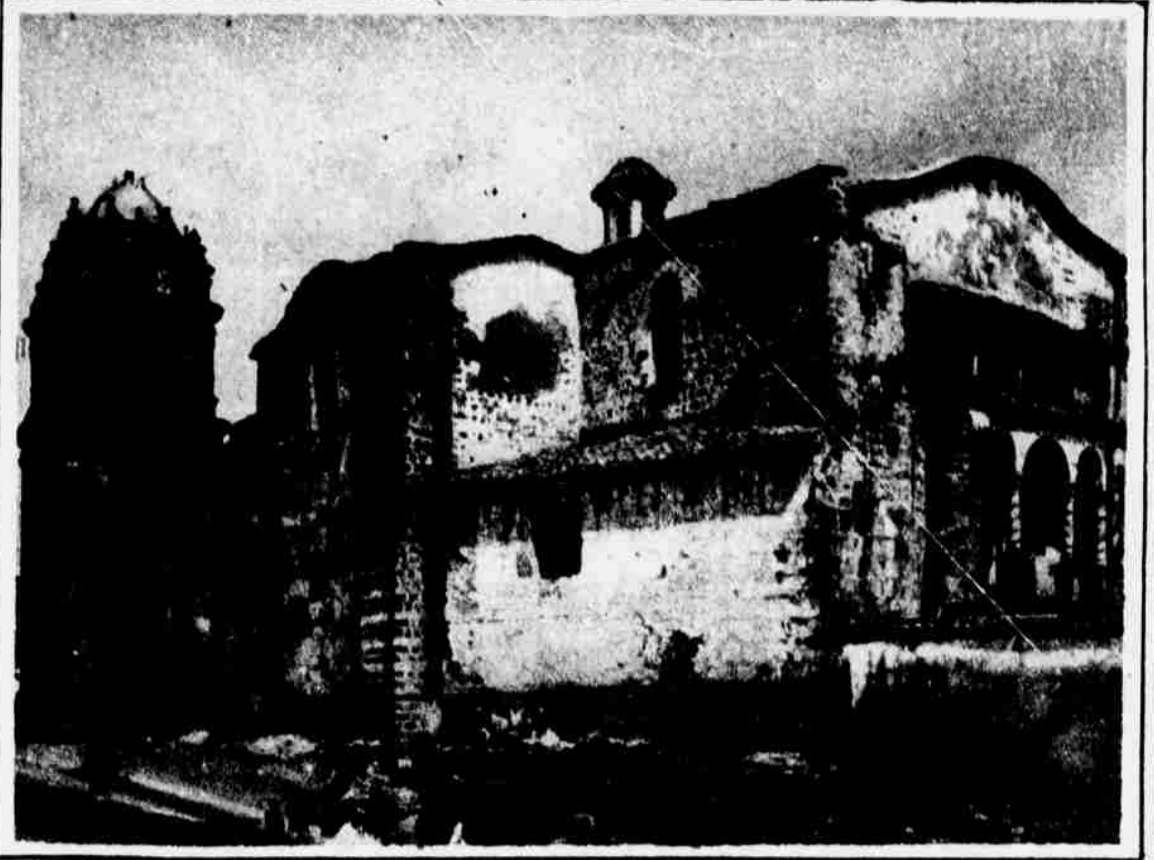
ONE OF THE NOT ONLY ODD BUT INTERESTING PICTURES OF THE CHURCH OF SANTO DOMINGO IN CUZCO, PERU. THE CHURCH OCCUPIES THE SITE OF WHAT ONCE WAS THE TEMPLE OF THE SUN.