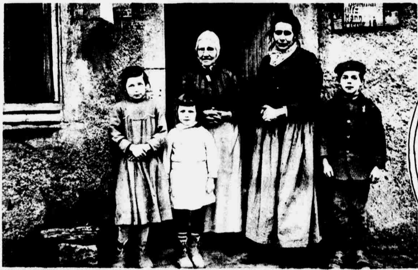
A FAMILY IN BERTRAMAIX, FRANCE, WHICH HAD BEEN UNDER THE GERMAN YOKE SINCE 1914, ONCE AGAIN HAVE THEIR PLACE AND LIBERTY. TWO SONS HAVE BEEN KILLED AND ONE A PRISONER IN GERMANY, AND ANOTHER ONE CRIPPLED FOR LIFE. THEY ARE WEARING PAPER SHOES WITH WOODEN BOTTOMS.

Photographs Copyright by Boston Photo News, Paul Thompson, Western Newspaper Union, Keystone View Co., International Film Service.