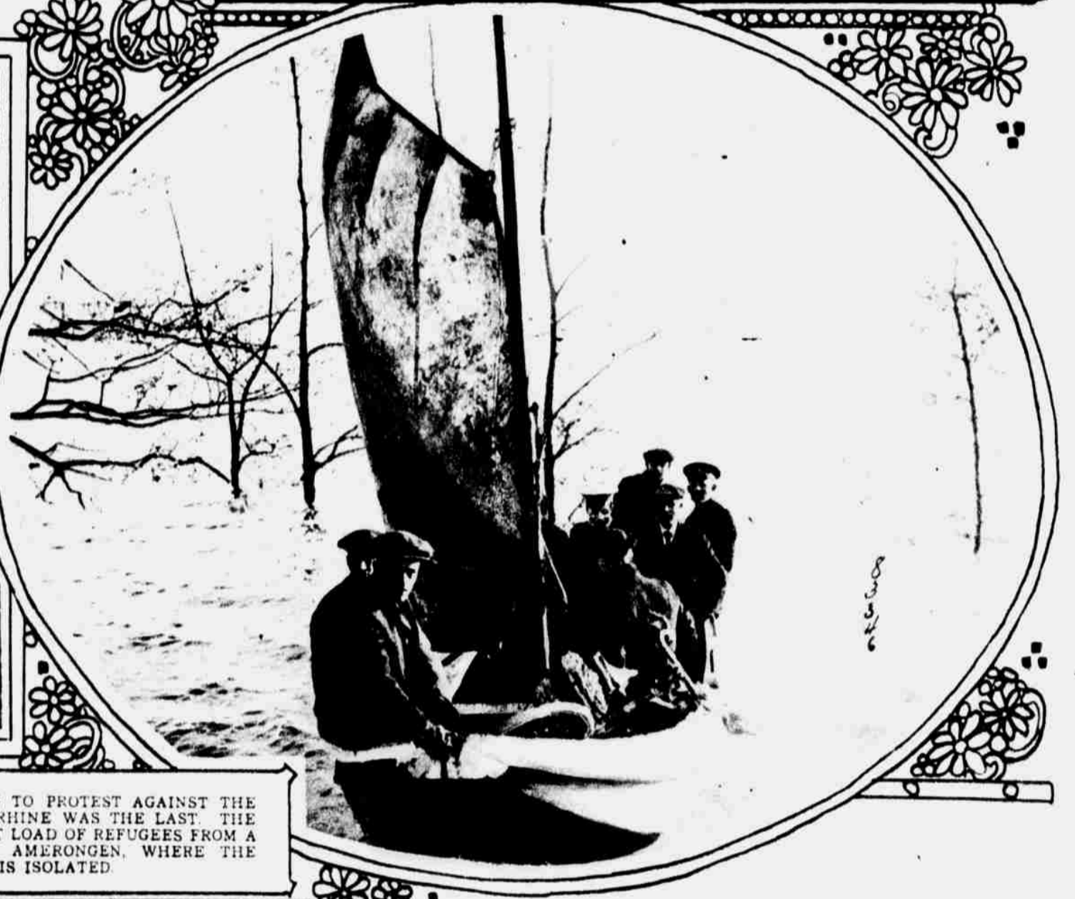
OF ALL THINGS RISING TO PROTEST AGAINST THE HOHENZOLLERNS THE RHINE WAS THE LAST. THE PICTURE SHOWS A BOAT LOAD OF REFUGEES FROM A FLOODED FARM NEAR AMERONGEN, WHERE THE KAISER IS ISOLATED.