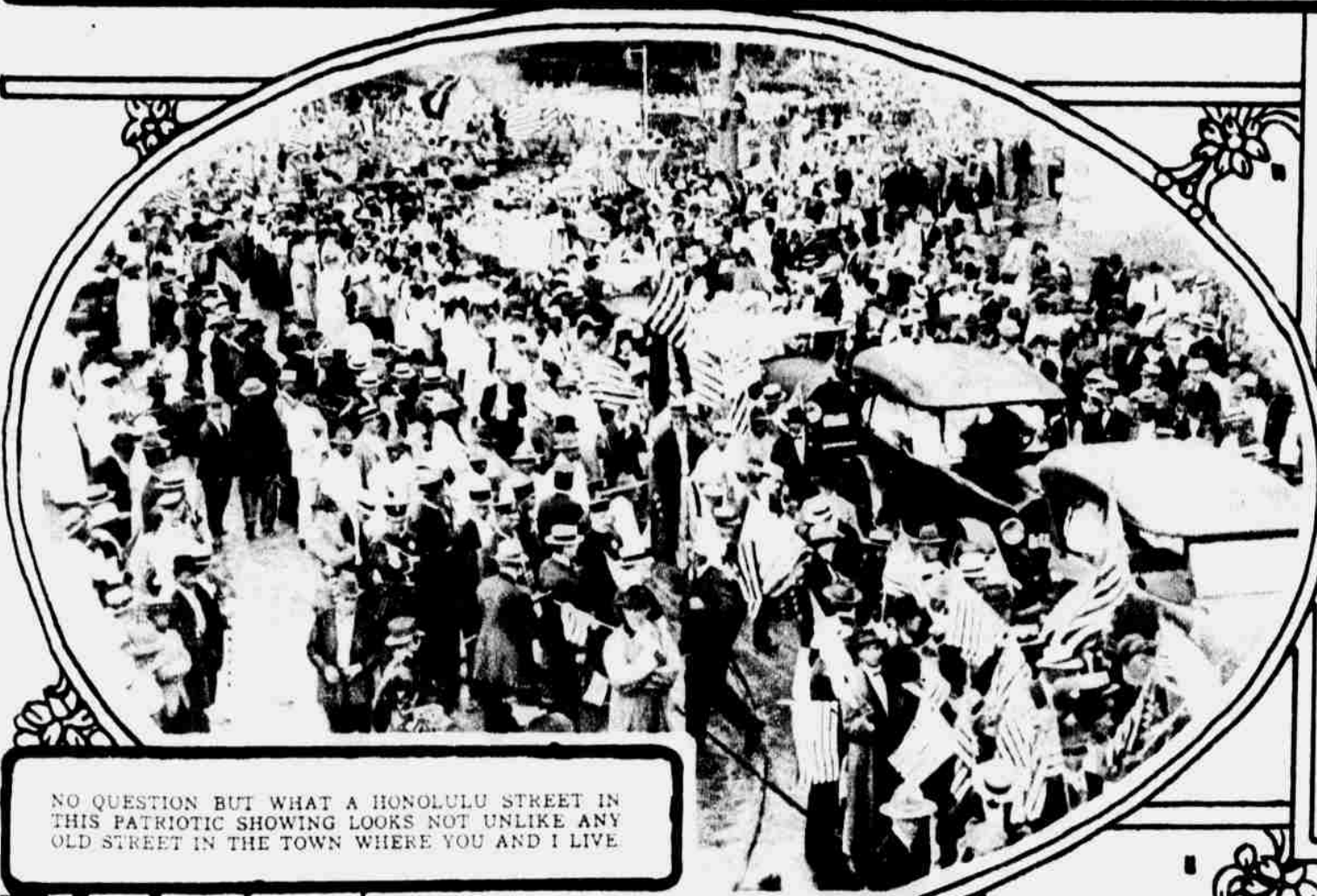
NO QUESTION BUT WHAT A HONOLULU STREET IN THIS PATRIOTIC SHOWING LOOKS NOT UNLIKE ANY OLD STREET IN THE TOWN WHERE YOU AND I LIVE.