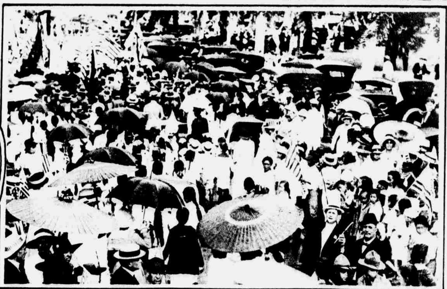
HERE THE SUNSHADES RATHER DRIVE IT HOME THAT IT MUST BE SOME TROPICAL SPOT.