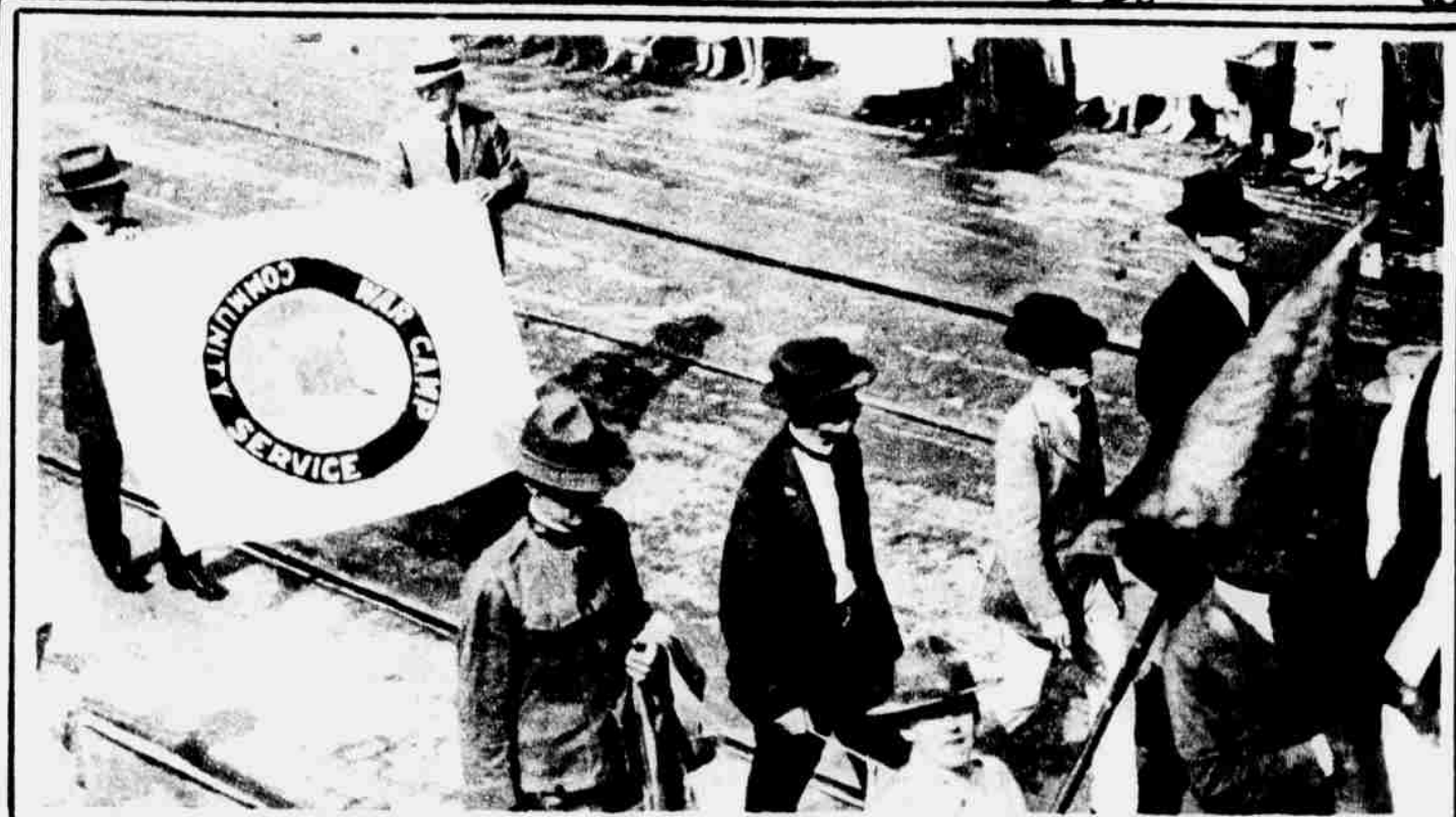
THE WAR CAMP COMMUNITY SERVICE KNOW THAT IT PAYS TO ADVERTISE, HENCE THE CONCEALMENT OF THEIR BANNER.