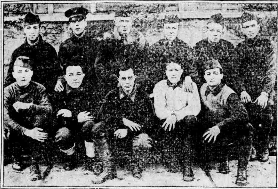
U.S. Army Boxers