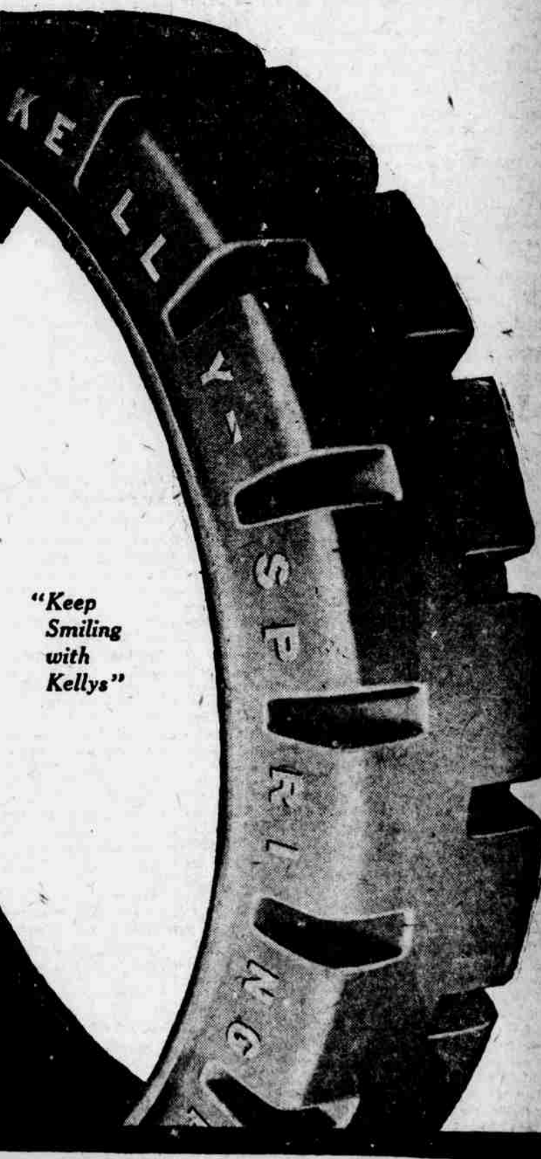
"Keep Smiling with Kellys"

OLD AGE STARTS WITH YOUR KIDNEYS. Science says that old age begins with weakened kidneys and digestive organs. This being true, it is easy to believe that by keeping the kidneys and digestive organs cleansed and in proper working order old age can be deferred and life prolonged far beyond that enjoyed by the average person.