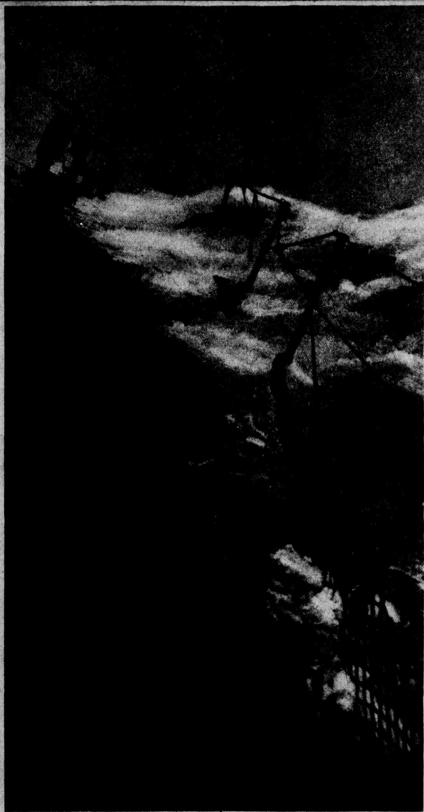
SHOWING THE LURCH OF A DESTROYER IN A GALE. DO YOU WONDER DESTROYER MEN COULD NOT STAY IN THEIR BUNKS?