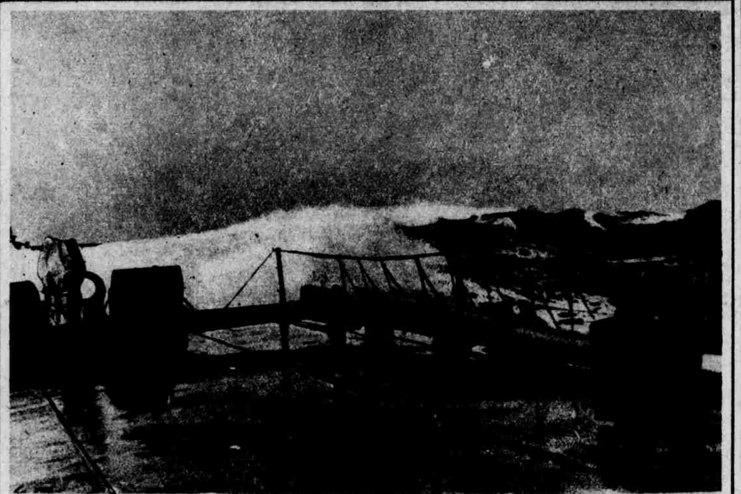
A REMARKABLE PHOTOGRAPH SHOWING THE U. S. S. CUSHING MANOEUVRING IN A GALE UPON THE HIGH SEAS