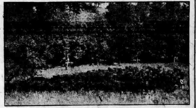
The Pride of a Sheridan County Land Owner.

Our best paying crops are Alfalfa, Corn and Hogs. Never a known case of cholera in Sheridan county. We put our hogs on the railroad at a cost of less than 2 cents per lb. Many of us ship from 1 to 10 cars each year.