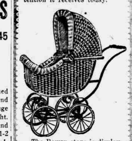
The Bowen store is displaying an immense stock of—

Give Baby an airing at every opportunity. The little tot's future depends much upon the care and attention it receives today.