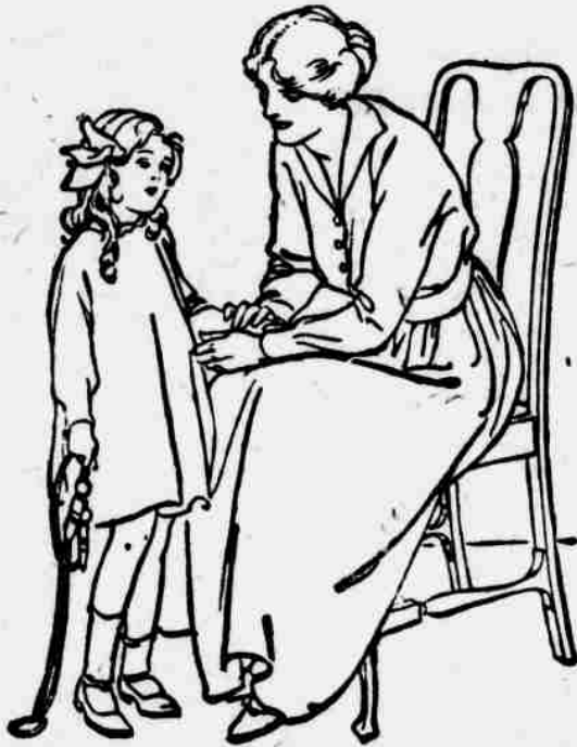
Constipated Children Gladly Take

"The Koreans are known as men of the pen, while the Japanese are men of the sword. If only the Koreans are given the opportunity to develop themselves without outside interference, they will produce a new model of Christian civilization in Asia."