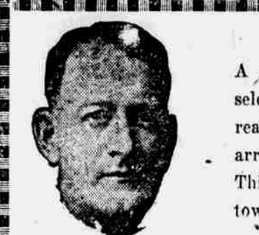
A Liberal Credit Service Awaits You Here

For over half a century thousands of women who have used the time-honored remedy, Mother's Friend, say that they entirely escaped nausea, nervousness and that peculiar distressing feeling so usual where nature is unaided.