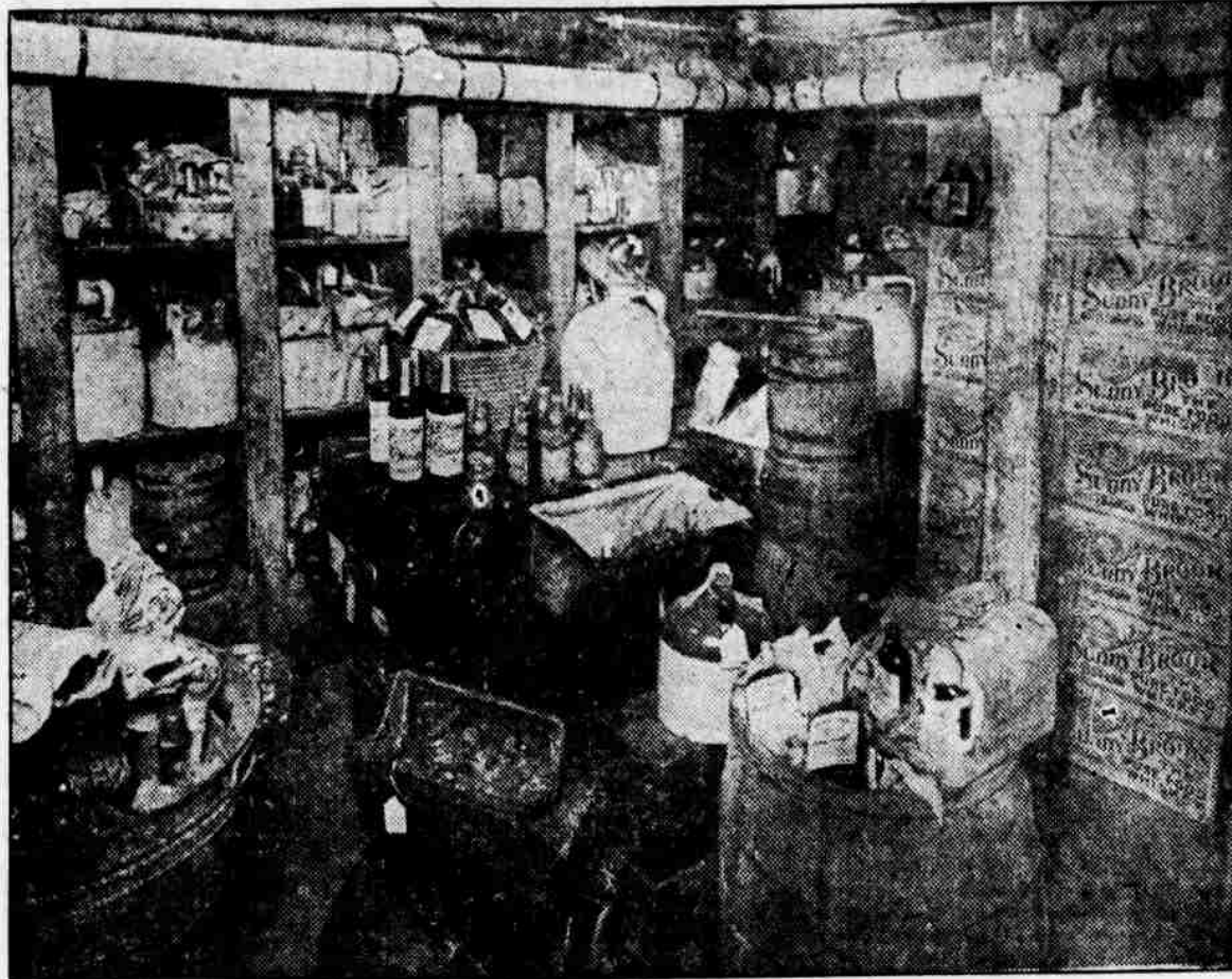
This is a picture taken by The Bee photographer of one corner of the liquor store room in the basement of central police station. It is said to be a drop in a bucket compared to the quantity sequestered and safe in the possession of Omaha bootleggers.