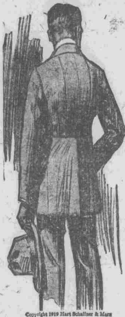
Copyright 1919 Hart Schaffner & Marx

We can fit you perfectly—the regular, the short, the stout, the slim—in clothes we know will give you perfect satisfaction.