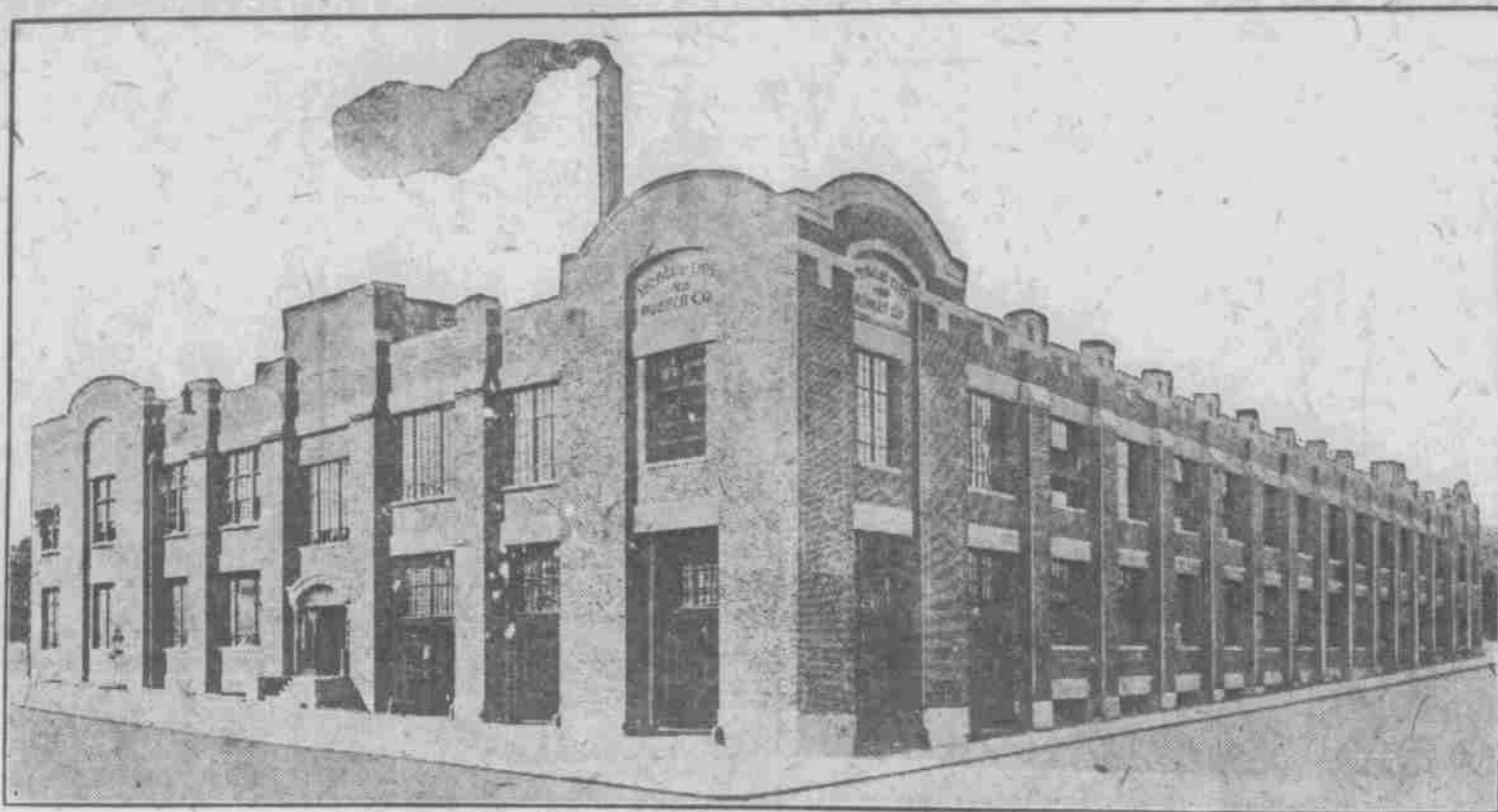
This factory, the home of the Sprague Tire & Rubber Co., turns out the quality tires and tubes you've been waiting for.