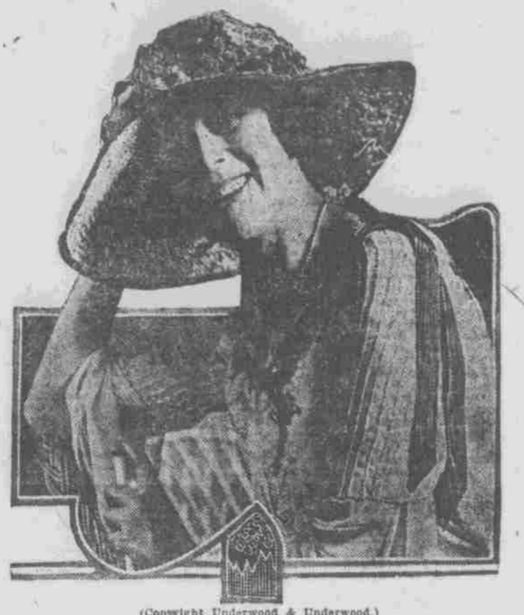
Smart hat for spring in turquoise and double faced ribbon of blue and blue braid with old fashioned flowers black.