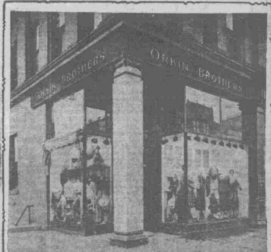
ORKIN BROS. LINCOLN STORE 12th & O Sts.