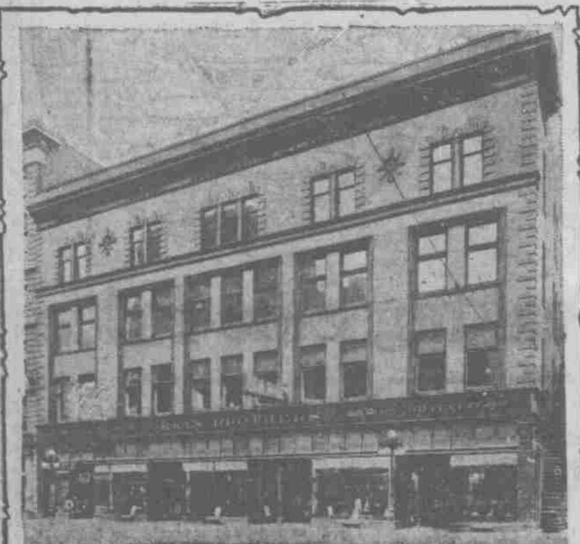
ORKIN BROS. SIOUX CITY STORE 4th and Pierce Sts.