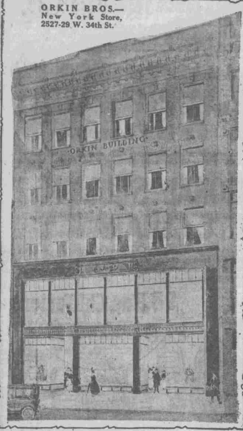
ORKIN BROS.— New York Store, 2527-29 W. 34th St.

The whole city will turn out Monday for this great Sale! The largest Ready-to-Wear event in years.