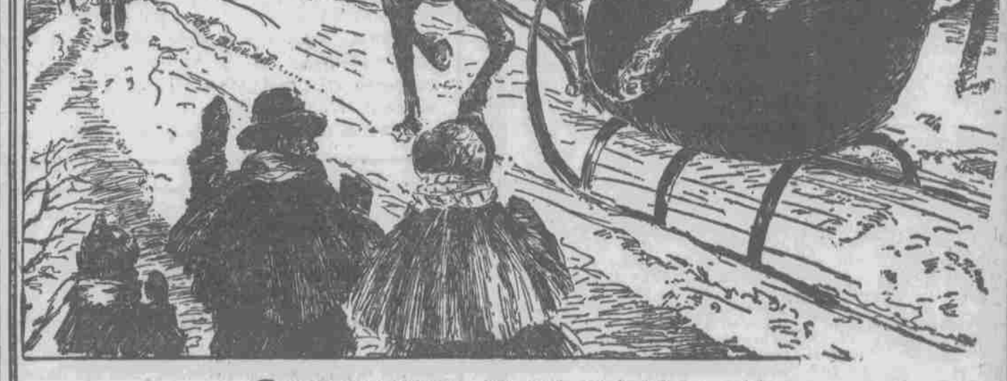
YOING TO CHURCH. A frosty New England day, a good horse Tand beloved companions. Rugged times; rugged weather; rugged characters! A bracing drive - rather to hear the gossip than the sermon!

High ideals! Scientific bakery knowledge! Modern equipment! Waste-saving efficiency! Cleanly surroundings! All these things-plus the big loaf-combine to produce a saving loafa clean loaf-a full-value, full-nourishment loaf-in Bersy Rosa,