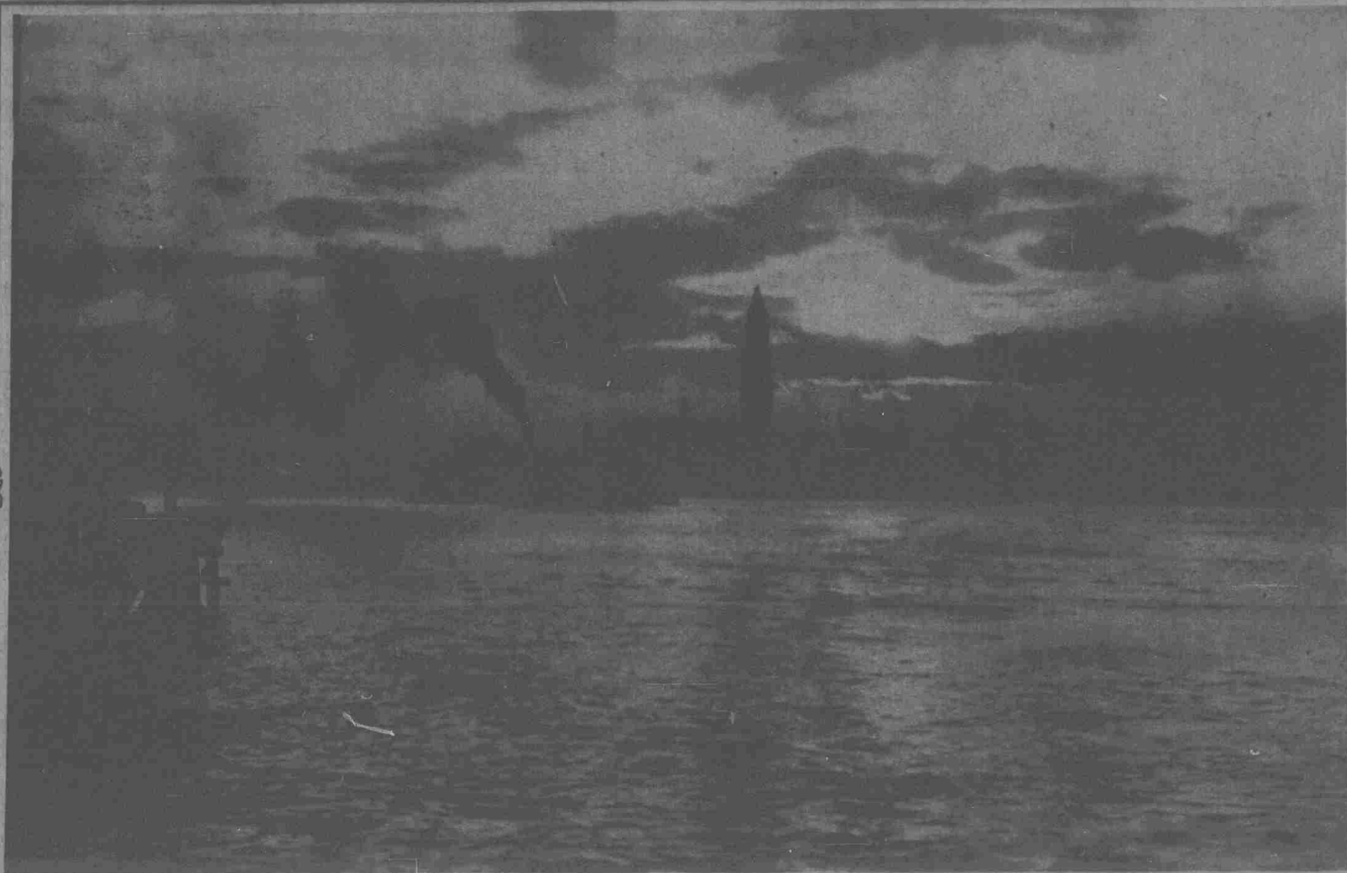
BOSTON HARBOR AND THE CUSTOM HOUSE TOWER SILHOUETTED AGAINST A SETTING NOVEMBER SUN, A MOST WORTHY EFFORT OF AN APPRECIATIVE PHOTOGRAPHER.