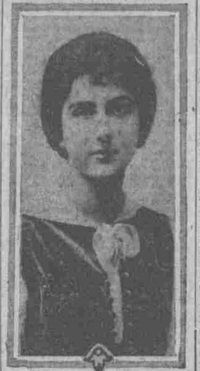
PRINCESS YOLANDA Princess Yolanda, eldest daughter of the king and queen of Italy, aided her royal parents in welcoming President and Mrs. Wilson upon their arrival in Rome.