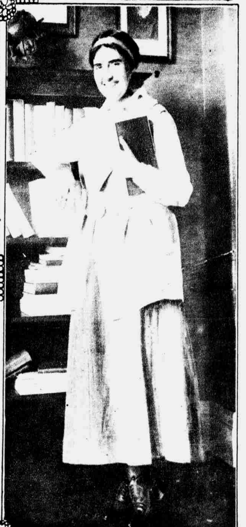
MISS OLGA G. MASARYK, DAUGHTER OF PROF. MASARYK, IS CALLED THE JOAN OF ARC OF THE CZECHS, FOR HER GREAT WORK IN ASSISTING HER FATHER.