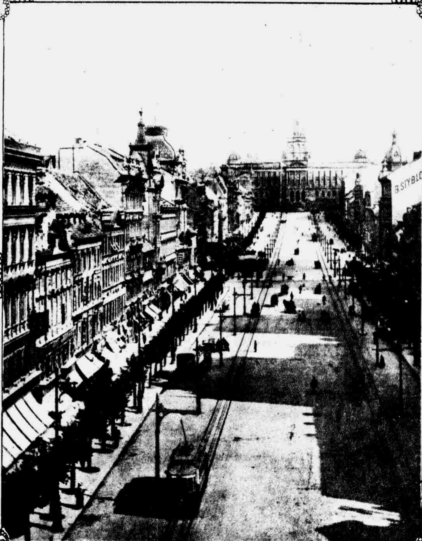
WENCESLAV SQUARE IN THE GREAT BOHEMIAN CITY OF PRAGUE. THE CITY WILL BE THE PERMANENT CAPITAL OF THE NEW CZECH NATION. IT HAS A POPULATION OF 450,000 AND IS ONE OF THE FINEST CITIES IN EUROPE.