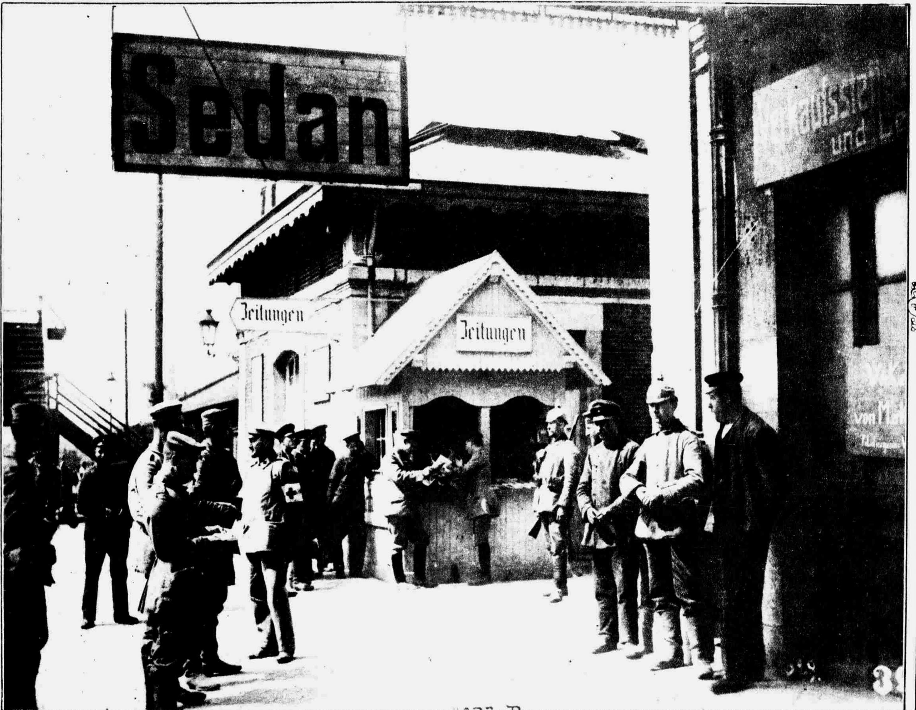
WHO WOULD HAVE DREAMED IN ALL THE INTERVENING YEARS OF WAITING AND FORBEARANCE THAT IT WOULD NOT BE THE TRICOLOR, BUT THE STARS AND STRIPES OF THE ALLY OF THE AMERICAN REVOLUTION, WHICH THE EYES OF THE FRENCHMEN LIVING IN SEDAN WOULD SEE STREAMING IN VICTORIOUS BATTLE ABOVE THEIR TOWN IN THE WAR THAT WAS TO SETTLE THE LONG SCORE WITH GERMANY?