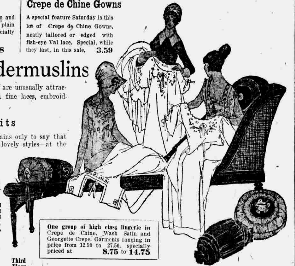
One group of high class lingerie in Crepe de Chine, Wash Satin and Georgette Crepe. Garments ranging in price from 12.50 to 27.50, specially priced at 8.75 to 14.75

Covers trimmed with lace, embroidery and insertion, in flesh or white, all sizes; Drawers of Cambric, with tucks and embroidery flouncing, specially priced, 35c while they last, in this sale, each.