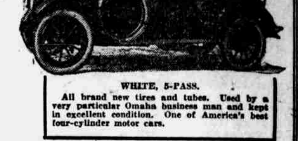
WHITE, 5-PASS. All brand new tires and tubes. Used by a very particular Omaha business man and kept in excellent condition. One of America's best four-cylinder motor cars.