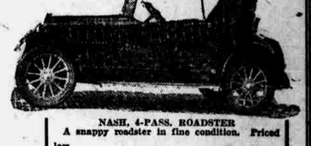
NASH, 4-PASS. ROADSTER. A snappy roadster in fine condition. Priced low.