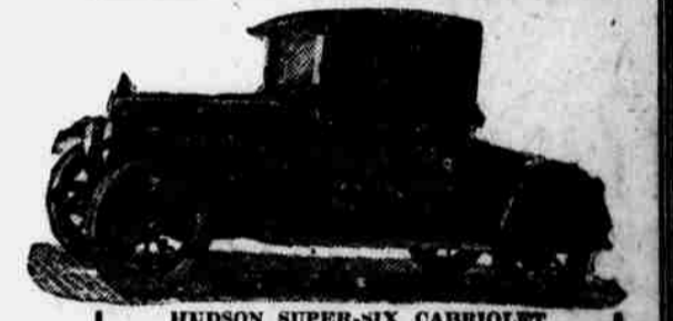
HUDSON SUPER-SIX CABRIOLET. In good condition. A mighty fine car for anyone who desires a small enclosed car.