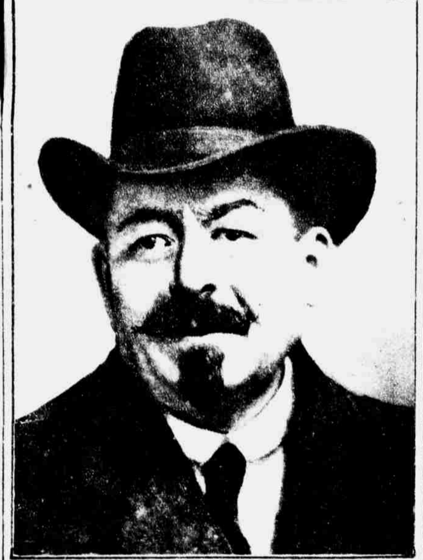
FRIEDRICH EBERT THE NEW CHANCELLER OF GERMANY. FOR ASSUMING OFFICE ISSUED A PROCLAMATION ANNOUNCING THAT THE NEW GOVERNMENT OF BERLIN HAD TAKEN CHARGE OF BUSINESS TO PREVENT CIVIL WAR AND FAMINE AND THAT A PEOPLE'S GOVERNMENT TO BRING ABOUT PEACE AS QUICKLY AS POSSIBLE WAS TO BE FORMED.