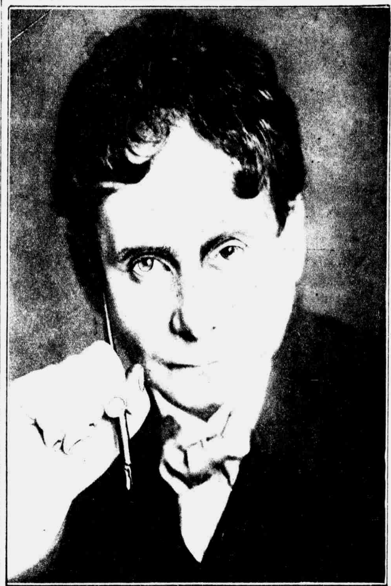
MAXIMILIAN HARDEN, A GERMAN WRITER WHO SEVERAL TIMES HAS BEEN SUPPRESSED FROM WRITING TOO FREELY IN GERMANY. HIS LUCID DESCRIPTIONS OF LIFE IN GERMANY AT THE PRESENT TIME AND WHAT THE GERMANS MAY EXPECT FROM THE WAR HAVE AROUSED WIDESPREAD COMMENT. HARDEN IS ONE OF THE FEW WRITERS IN GERMANY WHO DARES TO WRITE WHAT HE THINKS.