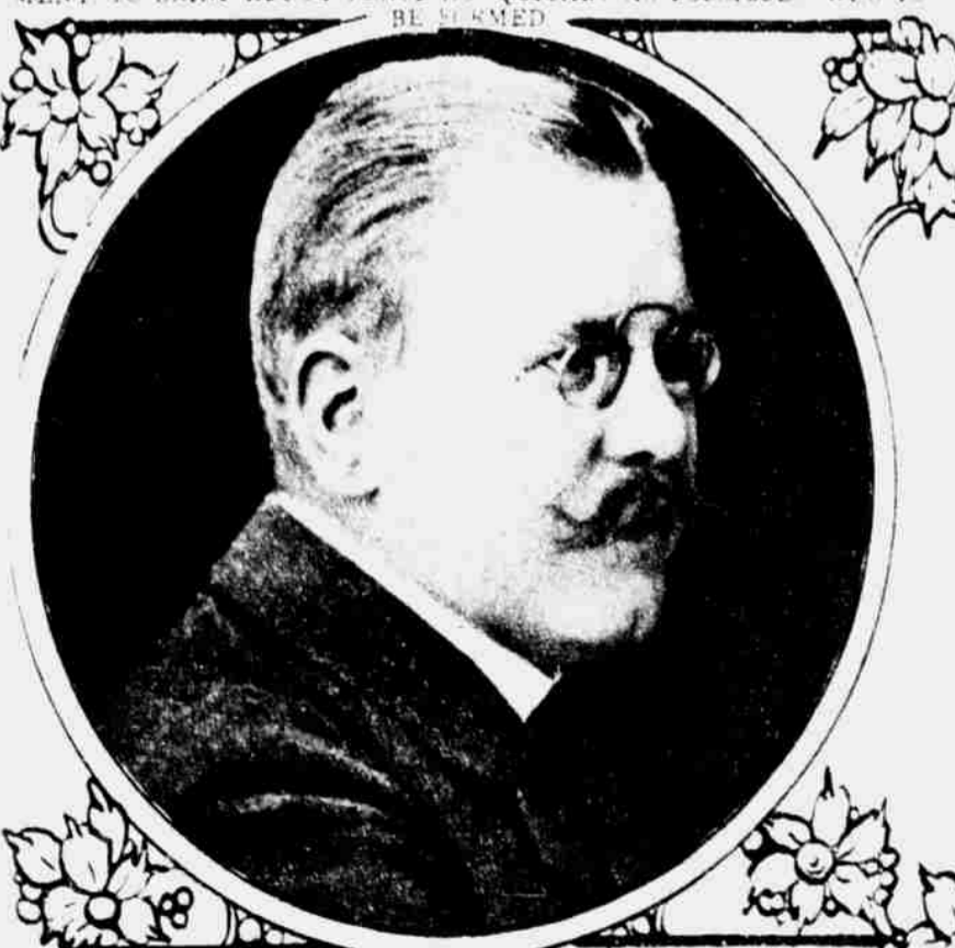
MATHIAS ERZBERGER, KNOWN AS AN ALL-ROUND DISTURBER AND ONCE CALLED AN AUTOCRATIC DEMOCRAT, THE MASTER POLITICIAN OF GERMANY.