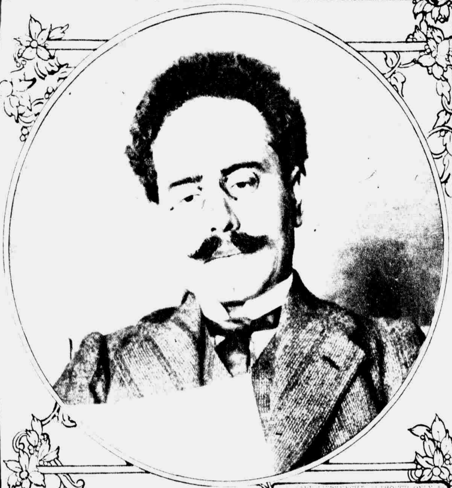
KARL LIEBKNECHT ALTHOUGH ONLY 41 YEARS OLD HAS BEEN ENGAGED IN THE SOCIALIST MOVEMENT FOR YEARS AND SINCE 1907 HAS BEEN THE IDOL OF THE ANTI-MILITARISTS. HE IS THE SON OF WILHELM LIEBKNECHT, A FAMOUS GERMAN SOCIALIST LEADER. WHILE SERVING A TERM IN PRISON IN 1905 HE WROTE A BOOK UPON ANTI-MILITARISM. KARL LIEBKNECHT WAS ELECTED TO THE REICHTAG ON THE SOCIAL DEMOCRATIC TICKET.

THE DAUGHTER OF A NOBLEMAN AND BORN TO A LIFE OF EASE, SHE HAS FOUGHT THE STATE FOR OVER 50 YEARS AND SPENT 44 YEARS OF HER 77 AS A POLITICAL PRISONER IN SIBERIA. ON THIS PAGE ARE SOME OF THOSE RESPONSIBLE FOR THE DOWN AND OUT CLUB