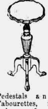
Pedestals and Tabourets, in mahogany, fumed oak and golden oak. An endless variety at $3.75 mahogany, as illustrated .....$4.00