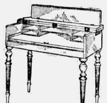
A Spinet Desk in Brown Mahogany .....$35.00