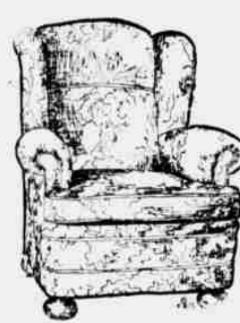
Luxurious overstuffed Arm-chairs, in tapestry or leather, make wonderful gifts. Prices from .....$39.00 to $125.00

Children's Furniture, Rocking Horses, Shoo Flies, Dolls, Doll Buggies, Pianos, Drums, Dishes, Stoves, Books, Games, Guns, Kiddie Cars, Sleds, Electrical Trains, Mechanical Toys, Wagons, Automobiles, Etc.