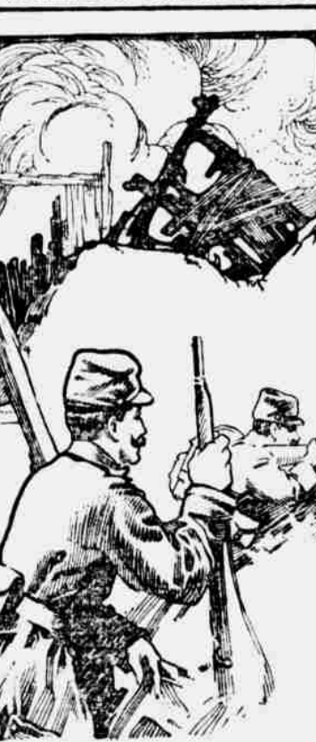
FRENCH TROOPS IN ALSACE

Captured German trenches at Hartmannswillerkopf, three years ago today, December 21, 1915.