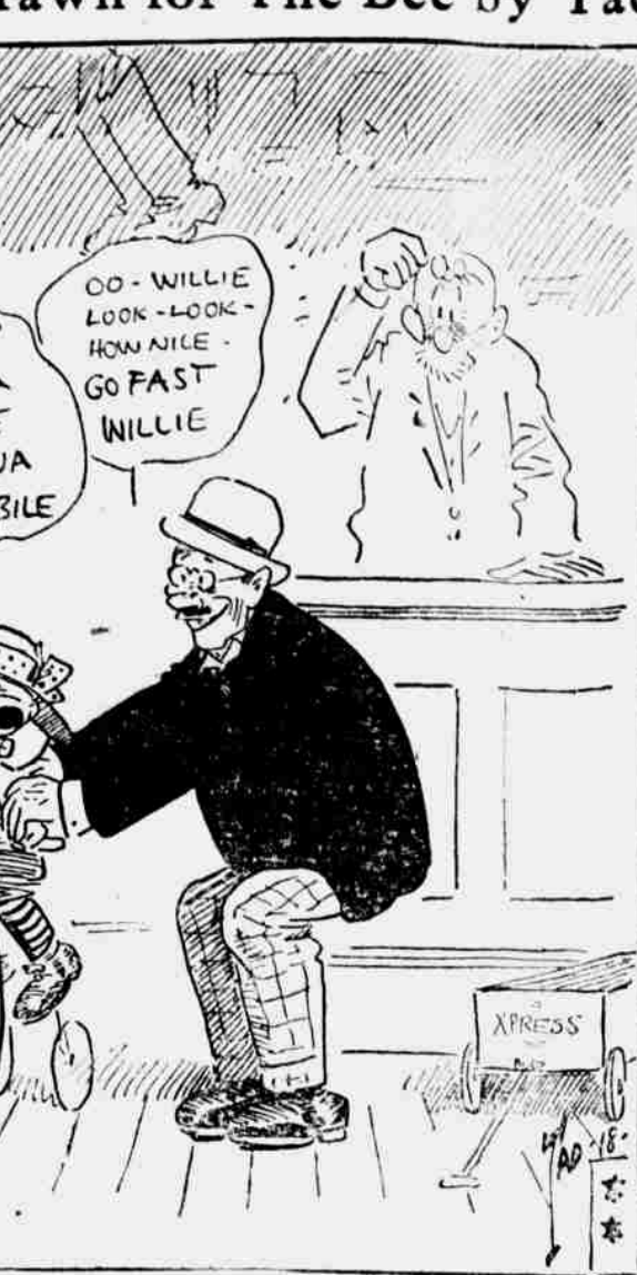
INDOOR SPORTS. TRYING TO SELL A TOY TO THE BABY OF ME TRYING OUT EVERYTHING IN THE JOINT.

ANNOUNCEMENTS. Towel Supplies. Omaha Towel Supply 207 S. 11th. D. 582.