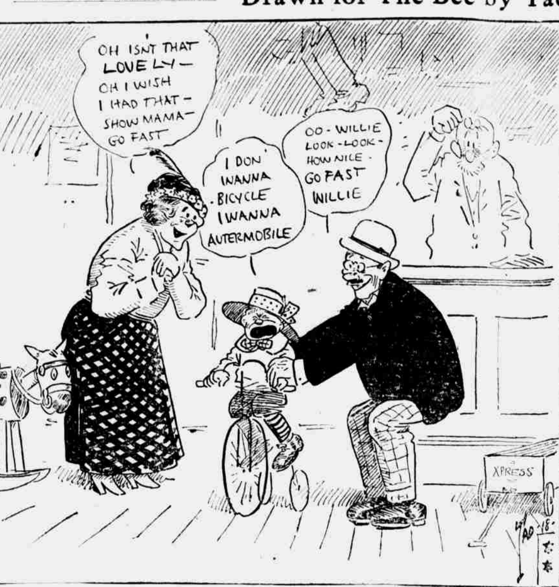
INDOOR SPORTS. TRYING TO SELL A TOY TO THE BABY OF ME TRYING OUT EVERYTHING IN THE JOINT.

ANNOUNCEMENTS. Towel Supplies. Omaha Towel Supply 207 S. 11th. D. 582.