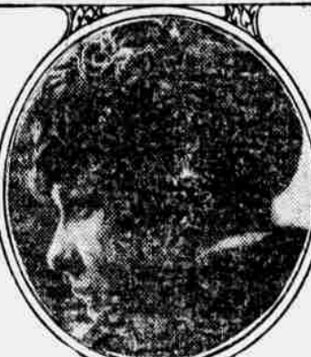
ABOVE—MRS. V. VANDERBILT; BELOW—MRS. VINCENT ASTOR.

Mrs. Vincent Astor and Mrs. William K. Vanderbilt, sr., both of whom have been engaged in canteen work overseas, have arrived from France aboard the French liner La Lorraine. Mrs. Astor had been in France since June, 1917. She was engaged in canteen work at Brest, where, with 450 women under her supervision, her canteen fed as many as 60,000 American soldiers in a day. Mrs. W. K. Vanderbilt, who also had been engaged in canteen work, is returning for a three month's furlough, after which she will return to France and aid further in the care of the American boys.