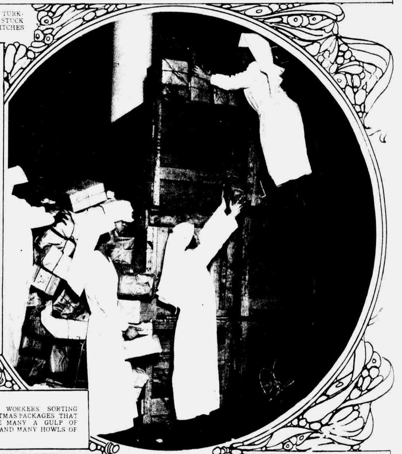
RED CROSS WORKERS SORTING THE CHRISTMAS PACKAGES THAT WILL CAUSE MANY A GULP OF HAPPINESS AND MANY HOWLS OF MERRIMENT.