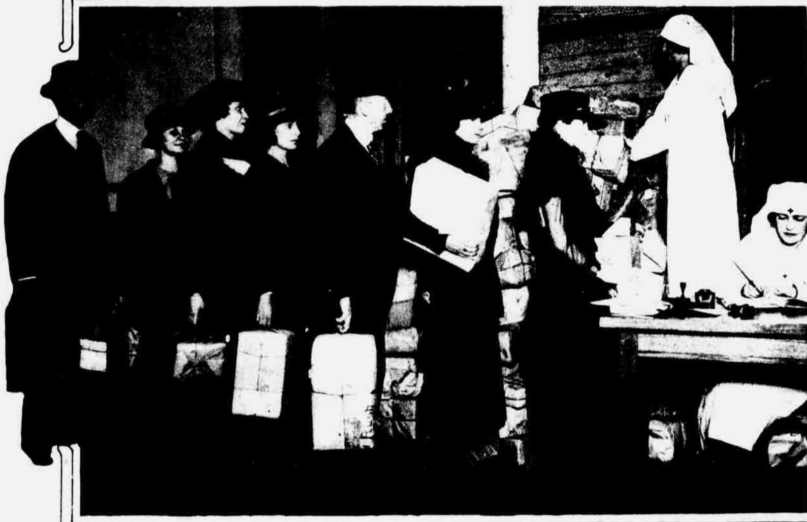
FATHERS, SISTERS AND SWEETHEARTS LEAVING CHRISTMAS PACKAGES AT THE RED CROSS HEADQUARTERS IN NEW YORK FOR AMERICAN PRISONERS OF WAR HELD IN GERMANY.