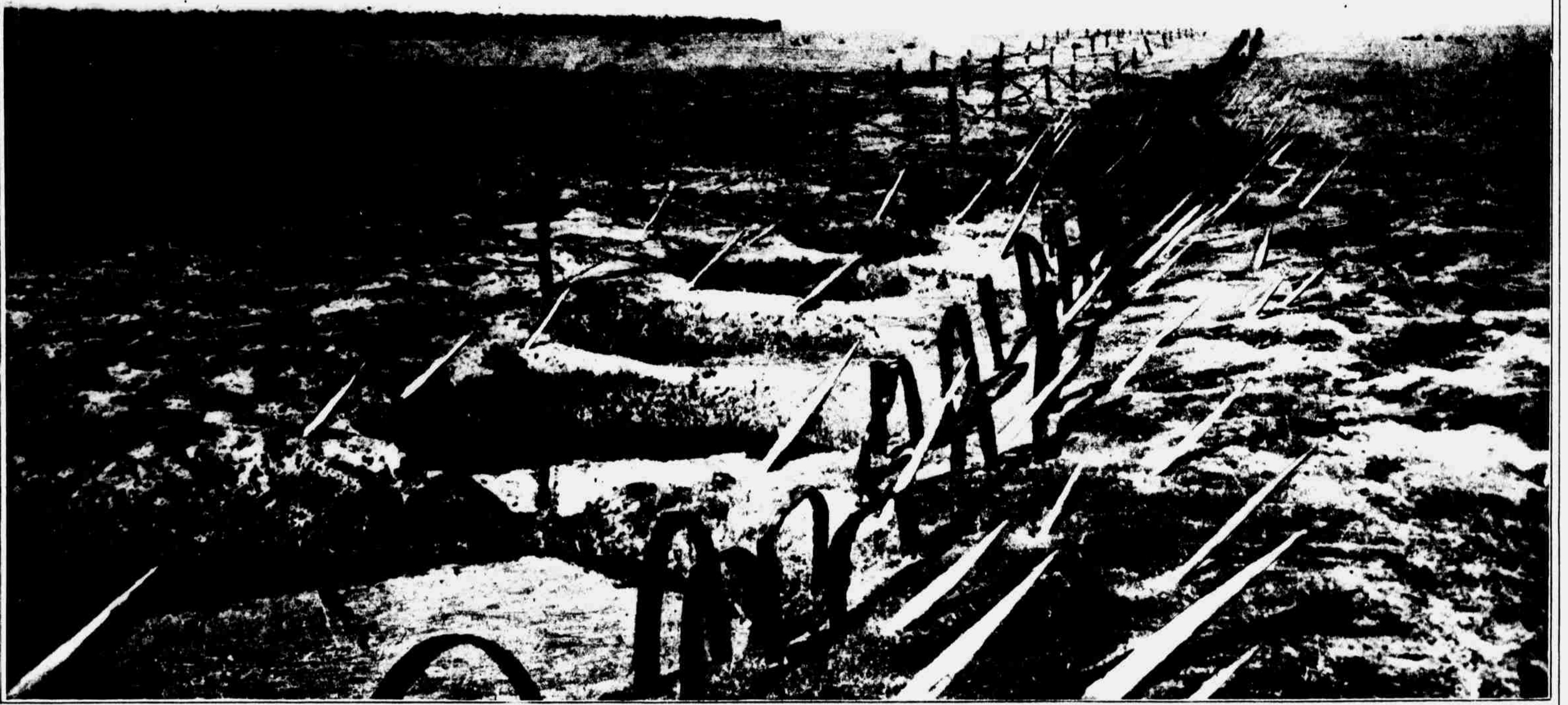
ONE OF THE MOST ATROCIOUS, BARBAROUS METHODS OF WARFARE THAT HAS BEEN WITNESSED WAS THAT EMPLOYED BY THE TURKISH FORCES IN PALESTINE WHEN THEY ATTEMPTED TO STOP THE VICTORIOUS BRITISH DRIVE. SHARPENED STAKES WERE STUCK IN THE GROUND AT A 45-DEGREE ANGLE BEHIND WHICH STEEP HOOPS WERE FASTENED UPRIGHT. BEHIND THESE, DITCHES WERE DUG. MORE STAKES WERE PLANTED AND THE WHOLE PACKED UP WITH BARBED WIRE ENTANGLEMENTS.