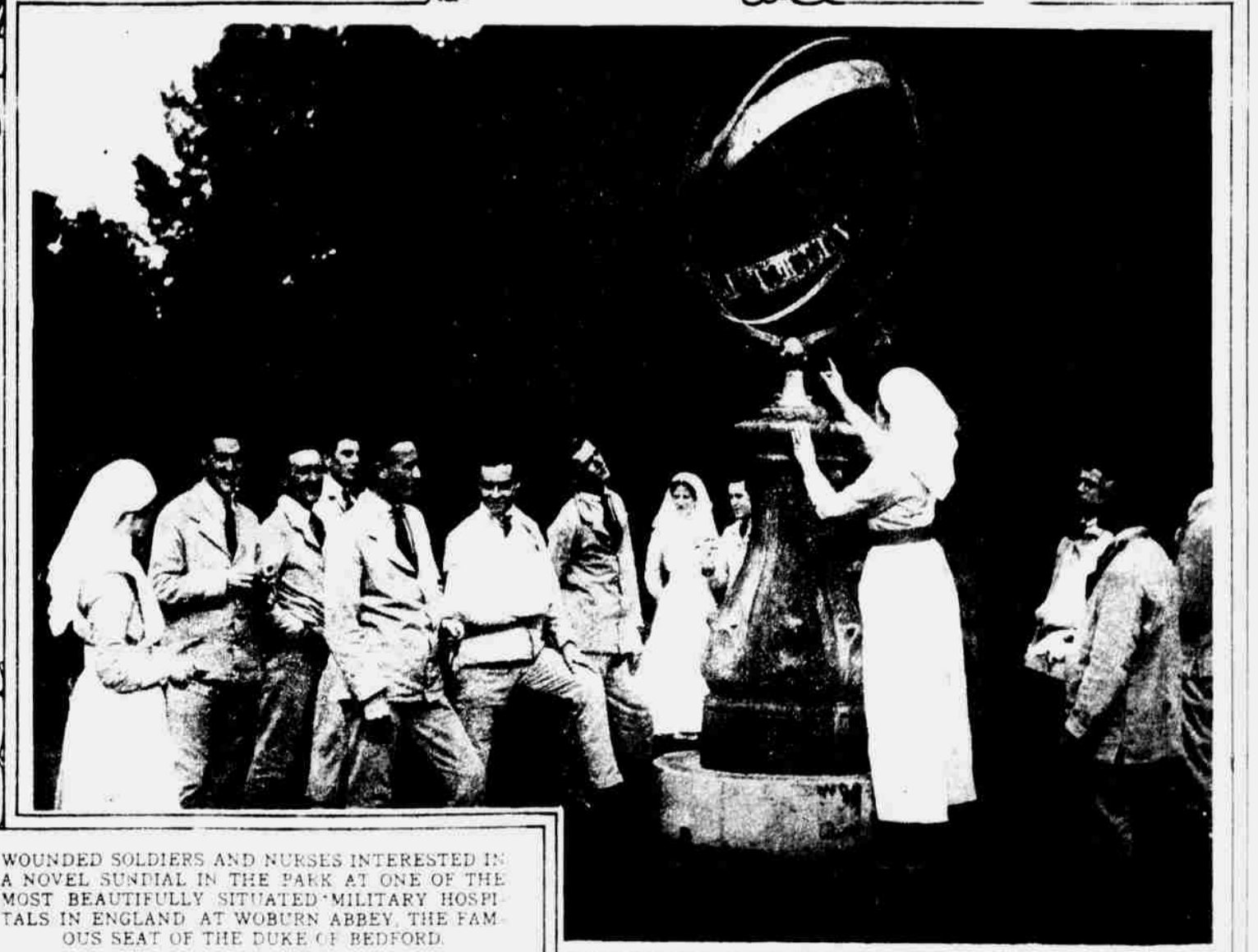
WOUNDED SOLDIERS AND NURSES INTERESTED IN A NOVEL SUNDIAL IN THE PARK AT ONE OF THE MOST BEAUTIFULLY SITUATED MILITARY HOSPITALS IN ENGLAND AT WOBURN ABBEY, THE FAMOUS SEAT OF THE DUKE OF BEDFORD.