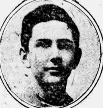
PRINCESS YOLANDA AND PRINCE UMBERTO OF ITALY