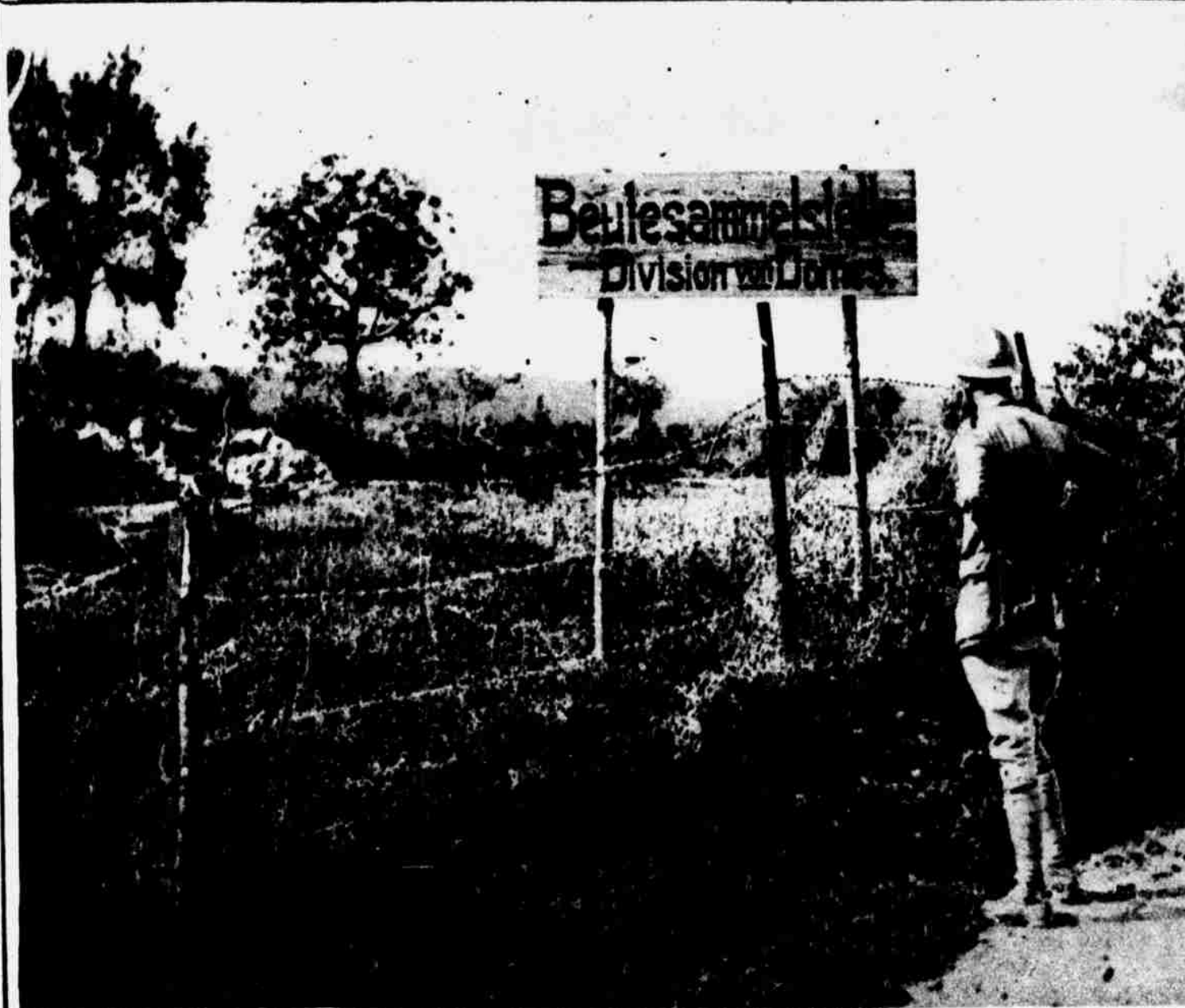
On the Somme Front. Booty-Depot (Beutesammelstelle) Abandoned by the Germans. The Germans Certainly Tried Hard and Exerted Themselves to Make the Roads Fool-Proof for Travel, and Never Hesitated in the Use of Signs and Proper Directions.