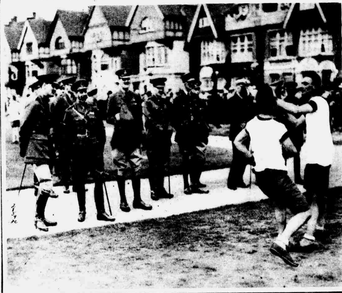
The King of England Witnesses the Knockout Blow During the Boxing and Physical Exercise Training of the Royal Air Force Cadets. King George is the Commander-in-Chief of the R. A. F.