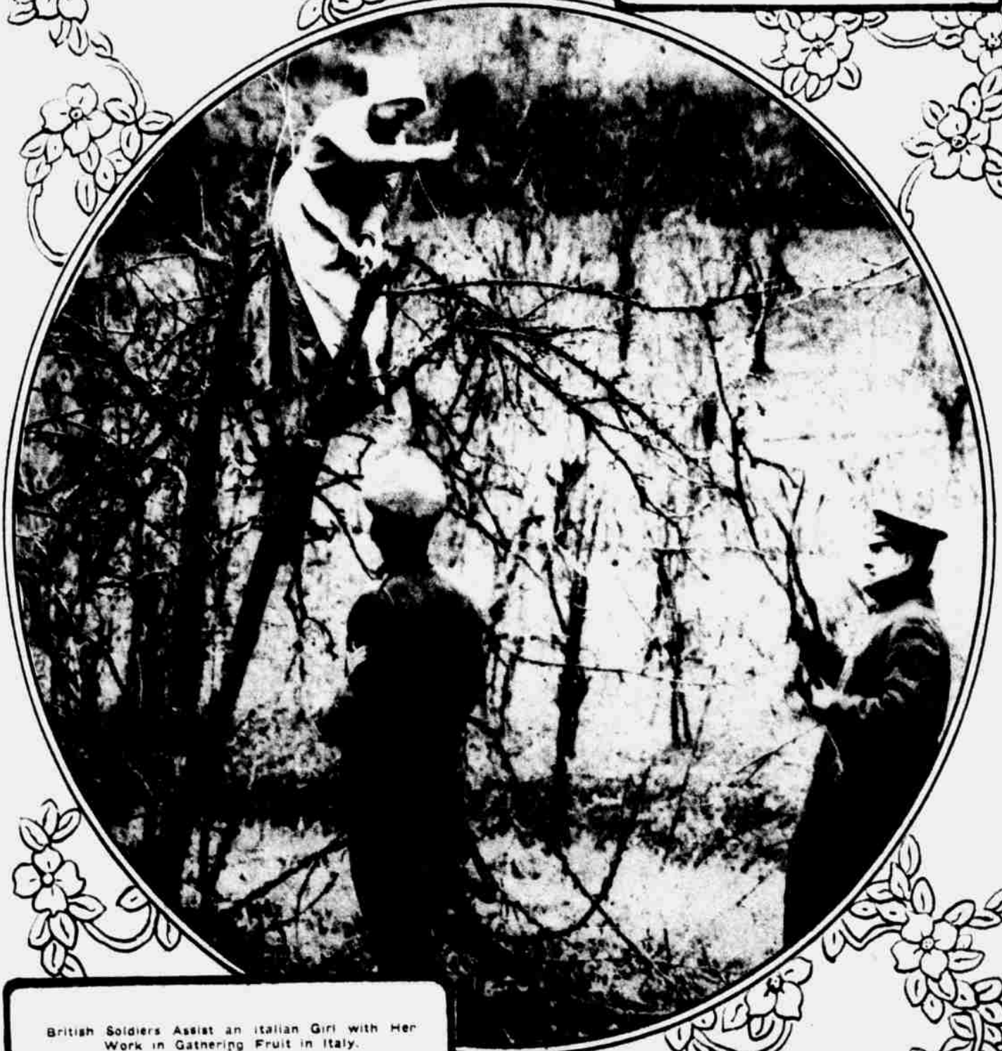
British Soldiers Assist an Italian Girl with Her Work in Gathering Fruit in Italy.