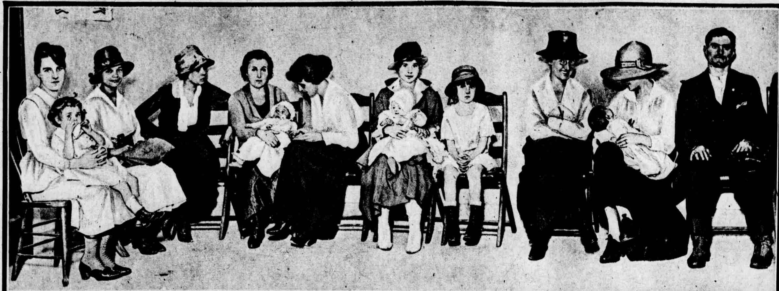
Red Cross Home Service in Grand Central Palace, New York, Where Wives, Mothers and Children of Soldiers and Sailors Overseas Get Advice and Assistance if Needed.