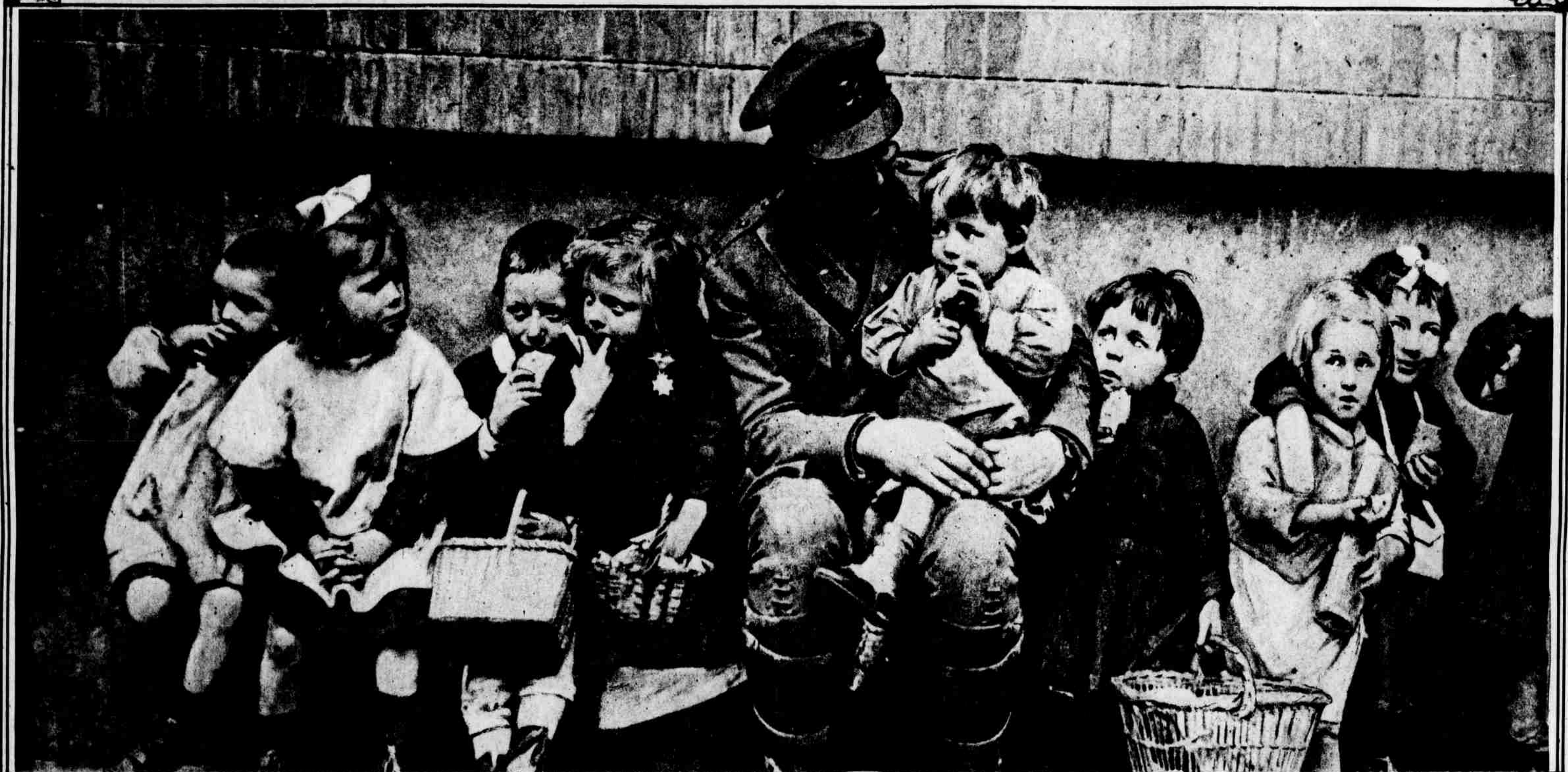
A Red Cross Doctor in France Who Provides Food and Clothing as Well as Medical Attendance for These Little French Tots.