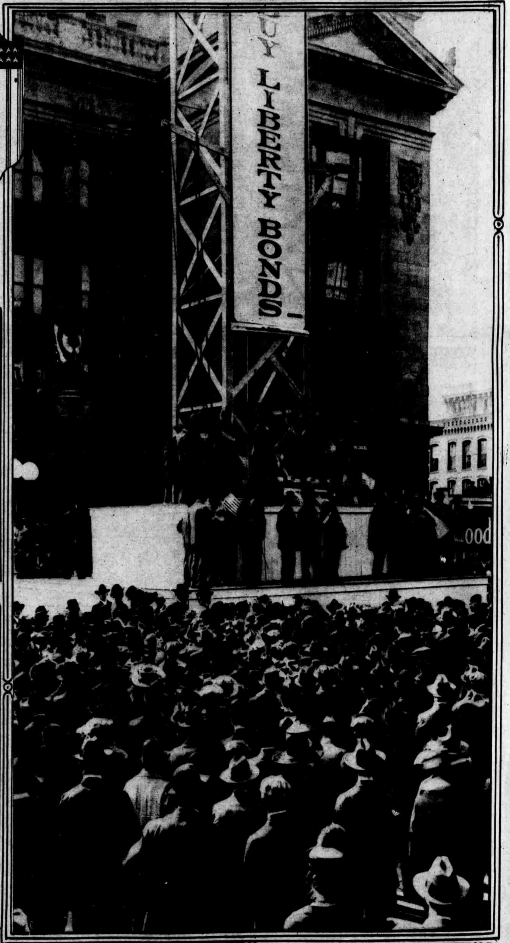
FOURTH LIBERTY LOAN: Laying the cornerstone of the Liberty obelisk, erected on the Court House square at the opening of the bond drive.