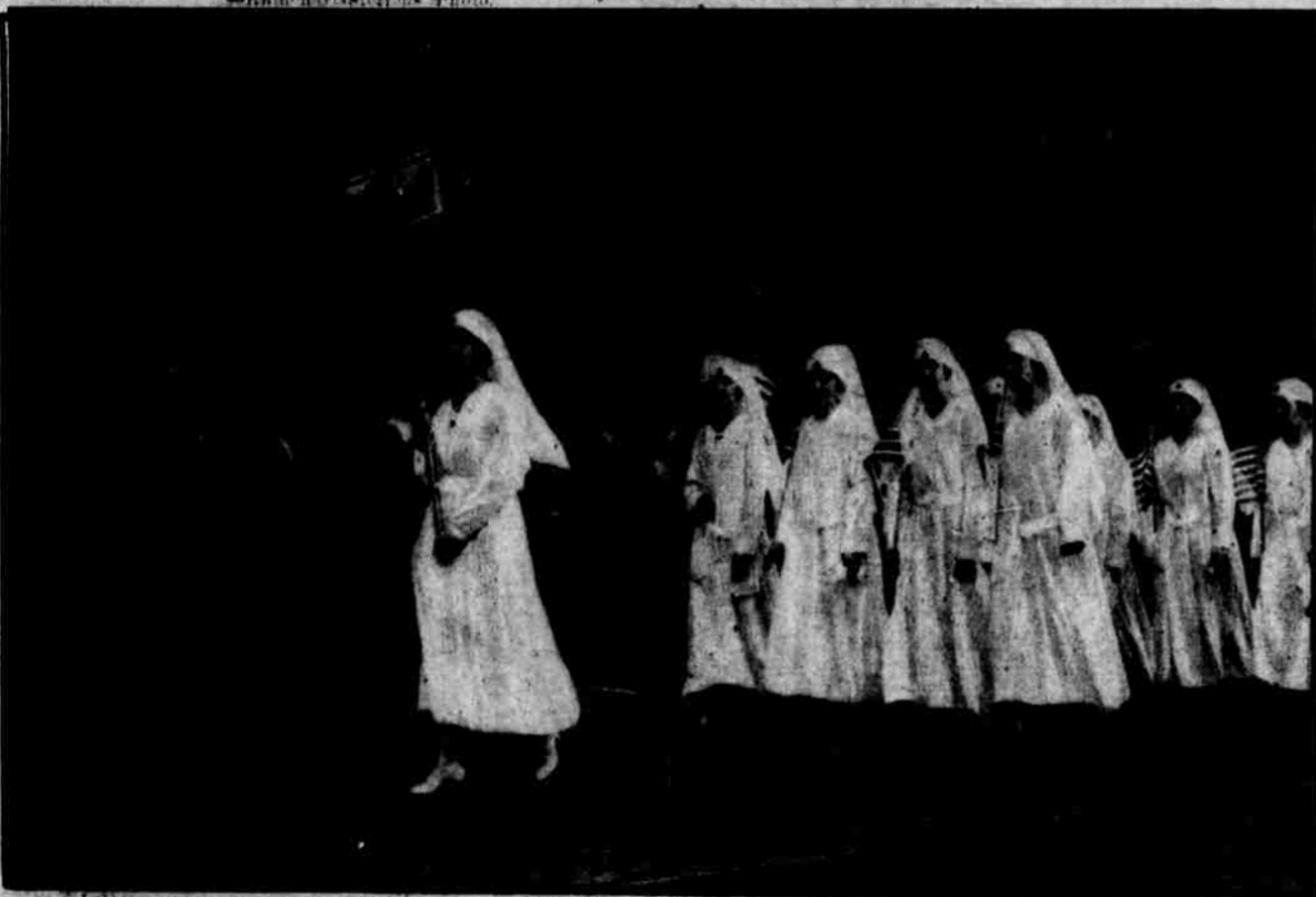
LIBERTY LOAN PARADE: Head of W. O. W. auxiliary passing in front of the Bee building.