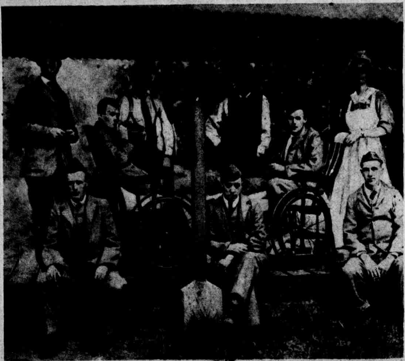
American Doughboys Who Were Wounded While Fighting in France Are Sent to English Convalescing Stations to Recuperate from Their Wounds. Here is Shown a Group of the Men Taking Things Easy, Under the Guardian Eyes of the Attending Nurse.