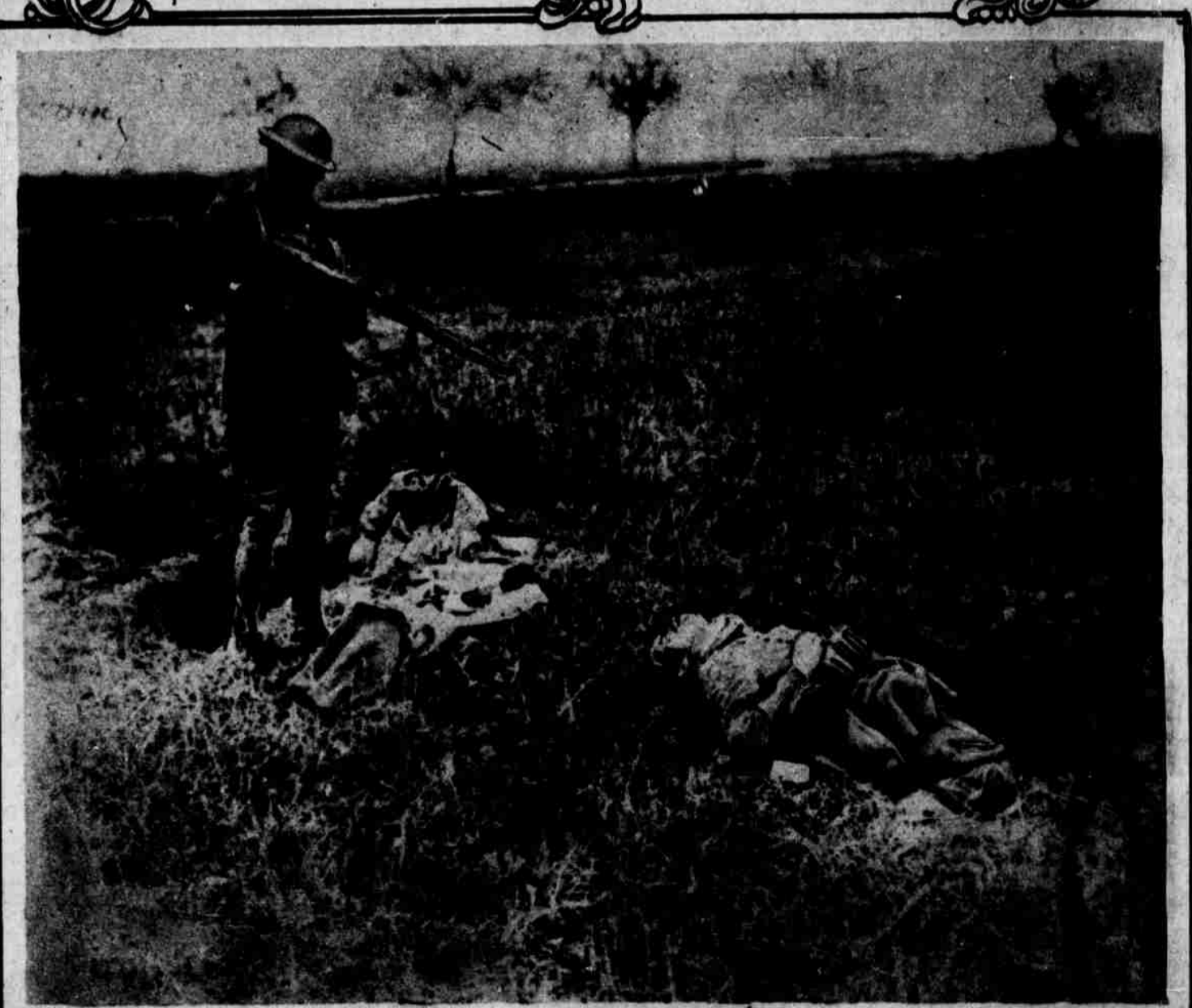
This Canadian Official Photograph Shows the Nest of a German Sniper Who Was Killed During the Advance of the Canadian Cavalry. The Sniper Fell Back with His Rifle Clutched in His Hands. The German Played the Game Fairly and the Canadians Gave Him a Singular Burial. One of the Canadians is Here Seen Examining the Dead Hun's Rifle and Other Effects.