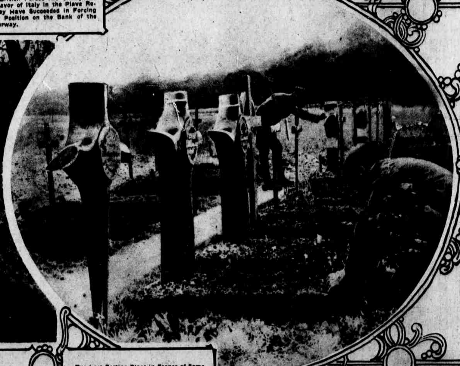
The Last Resting Place in France of Some British Airmen. Damaged Propellers Are Utilized as Headstones, and the Graves Are Carefully Looked After.