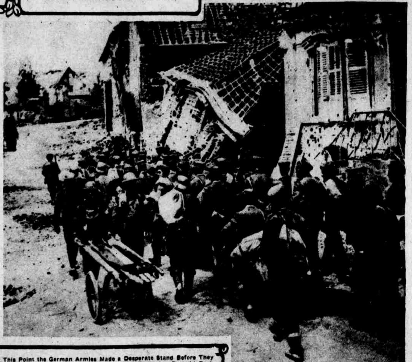
At This Point the German Armies Made a Desperate Stand Before They Evacuated. Many Prisoners Taken Near This Town Are Brought Back to the Scene of the Fighting as Prisoners of War.