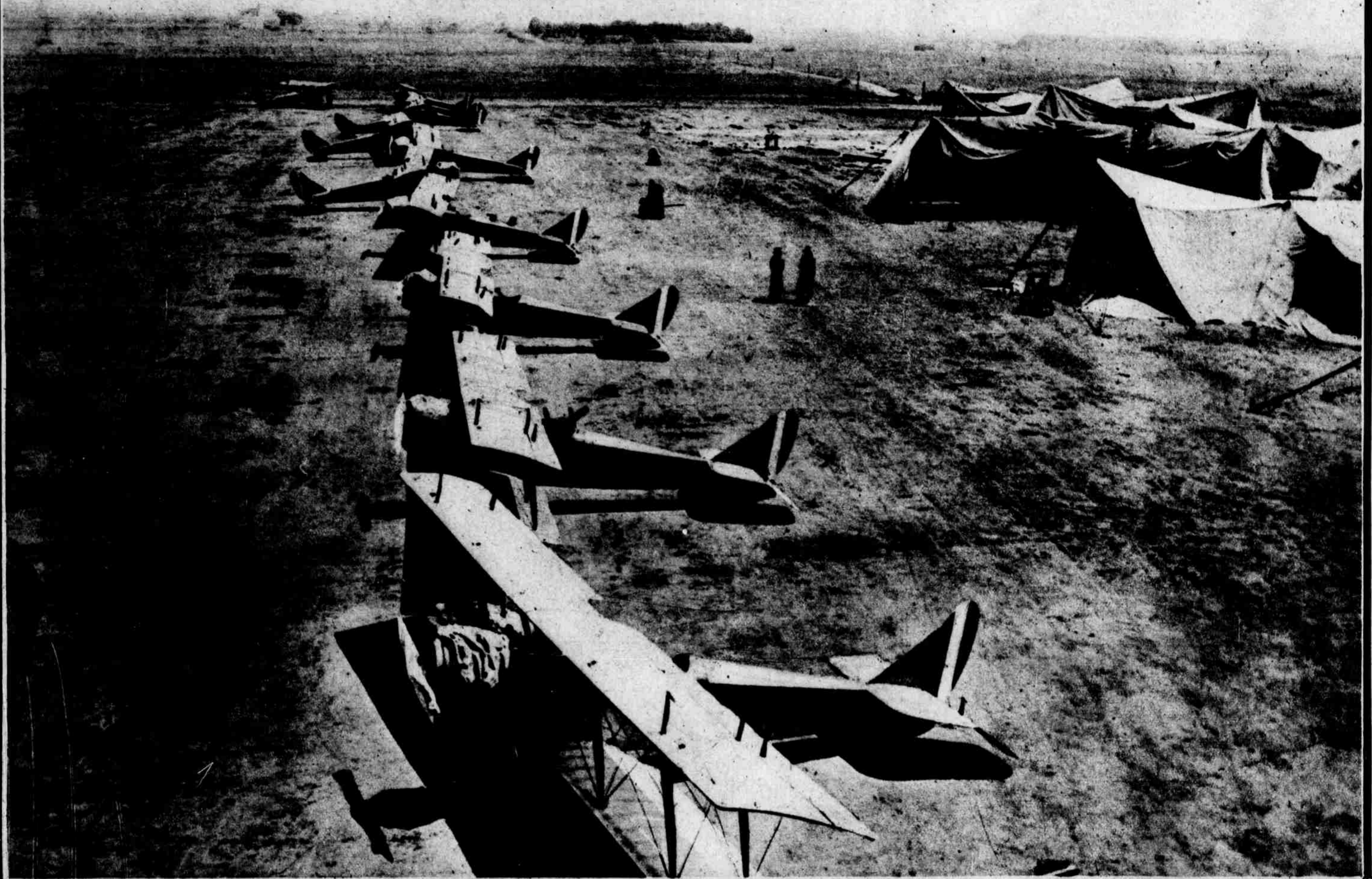
Squadron of Bombing Planes at U. S. Aerial School. A School for Aerial Gunners is Maintained by the United States Government at North Island, California. The Student-Pilot is Taught How to Handle a Machine-Gun Under Actual Flying Conditions and He Becomes an Expert at Bagging the Rocks.