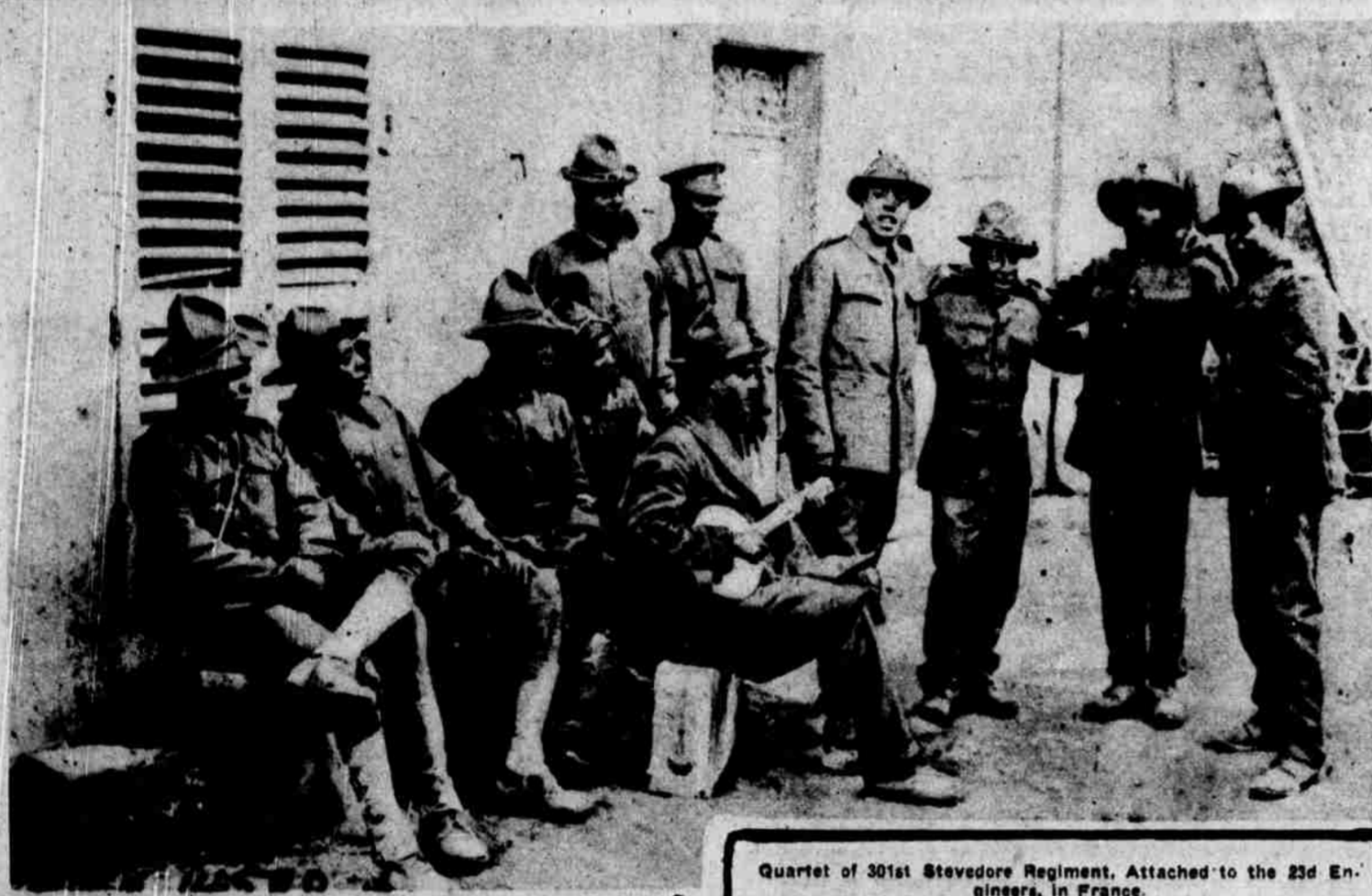
Quartet of 301st Stevedore Regiment, Attached to the 23d Engineers, in France.