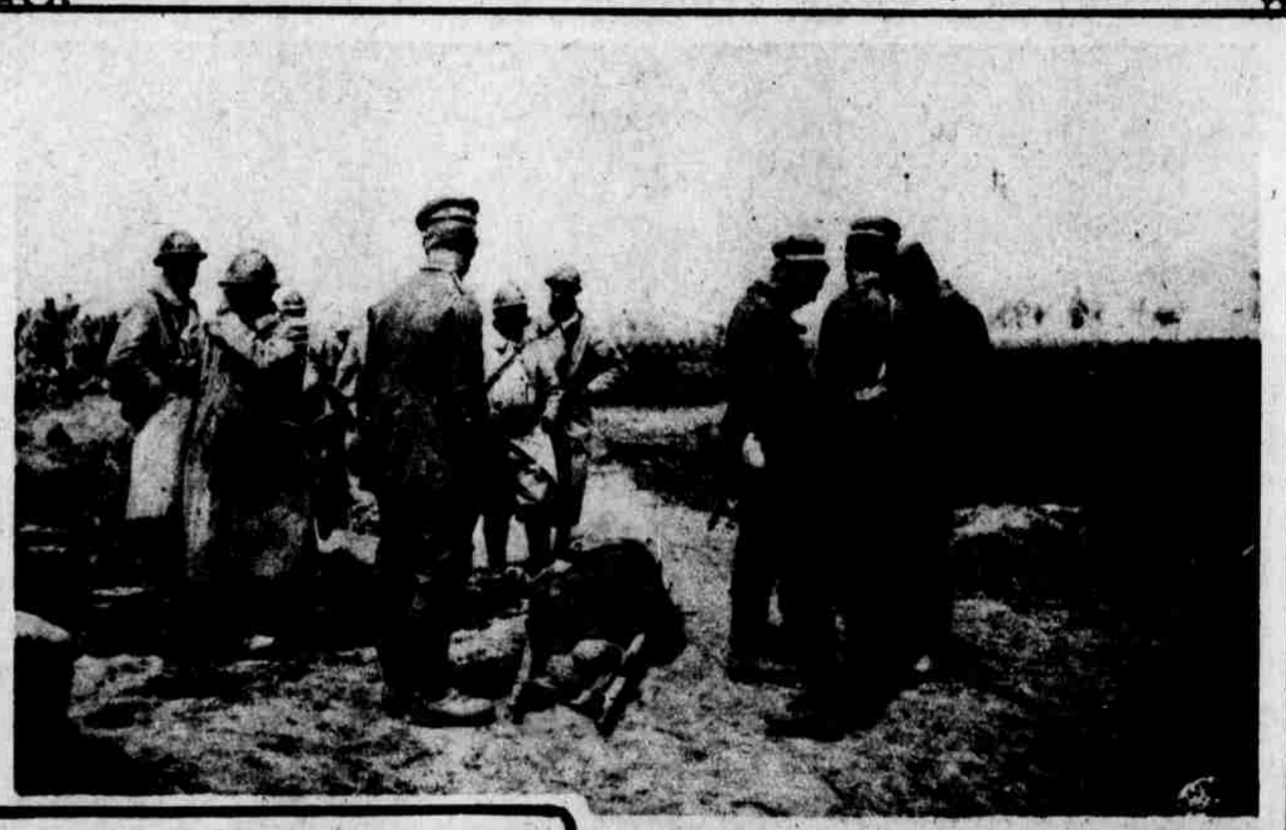
German Prisoners Captured at De Tillolay.