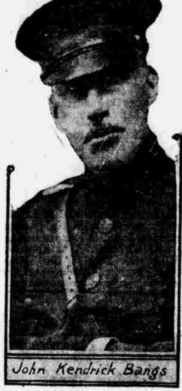
John Kendrick Bangs, humorist, writer and lecturer, will open the Omaha society of Fine Arts lecture course Monday at 4 p. m.

John Kendrick Bangs, humorist, writer and lecturer, will open the Omaha society of Fine Arts lecture course Monday at 4 p. m. in the ballroom of the Fontanelle.