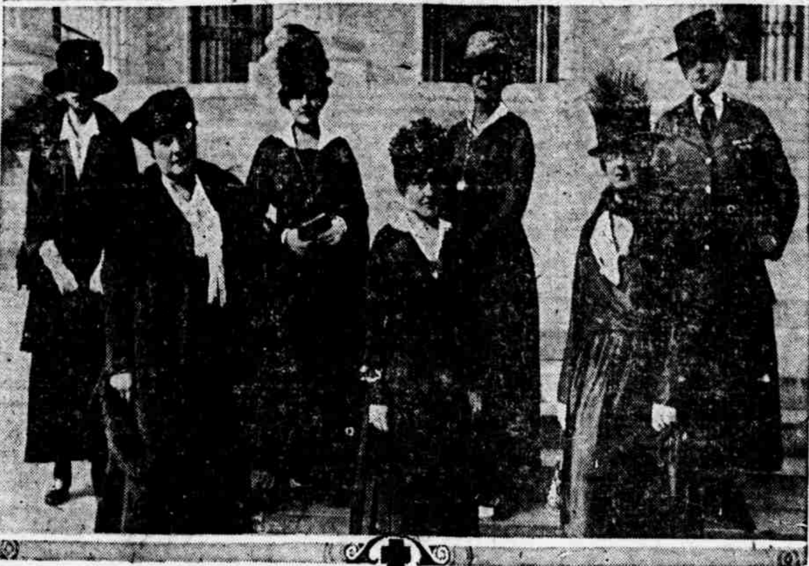
The women's advisory committee of the American Red Cross meets monthly at the national headquarters in Washington, D. C., to formulate recommendations on matters affecting the interests of the women of the Red Cross...