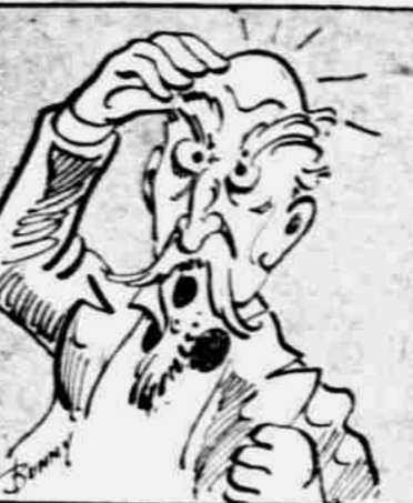
"WOW! WOW! WOW!" CRIED BALD PATE.