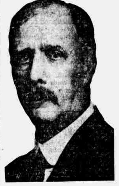
"He's All Right"